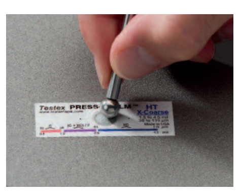
Stainless Steel Burnishing Tool ensures consistency