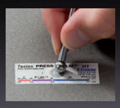
For use with Testex<sup>™</sup> Press-O-Film<sup>™</sup> Replica Tape

Digital spring micrometer measures and records peak to valley surface profile height using replica tape