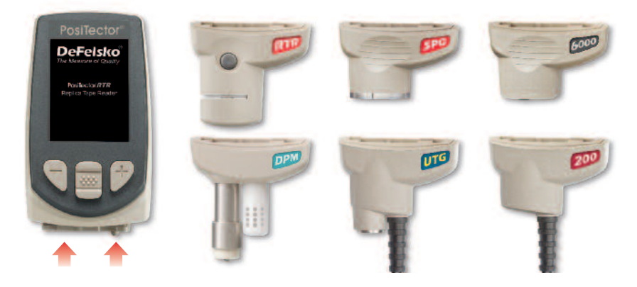
PosiTector bodies accept all 6000, 200, DPM, UTG, SPG and RTR probes