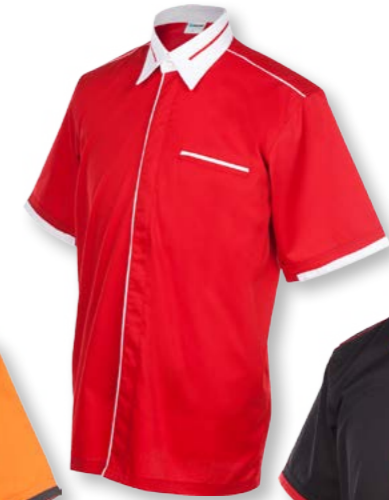
FC 2002 RED / WHITE