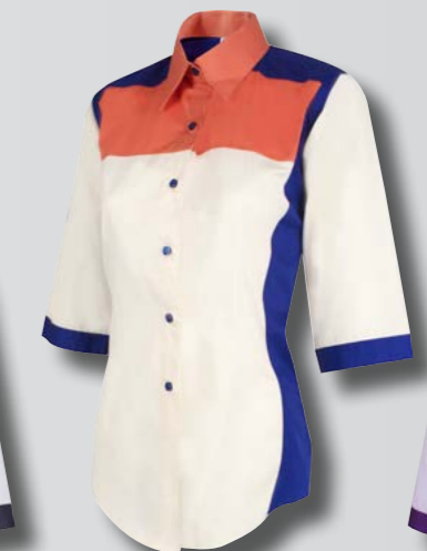
FC 3703 CREAM / PEACH / ROYAL BLUE