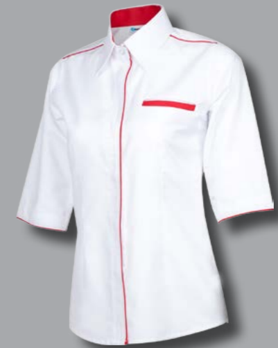
OF 1101 WHITE / RED