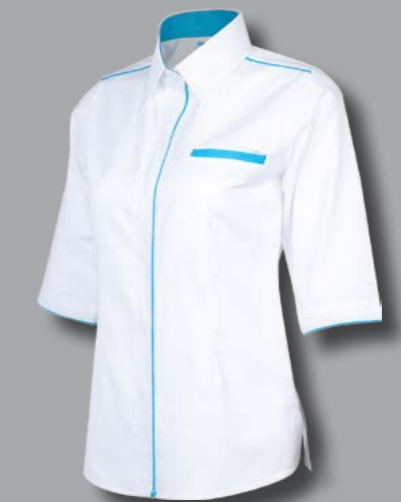
OF 1103 WHITE / CYAN