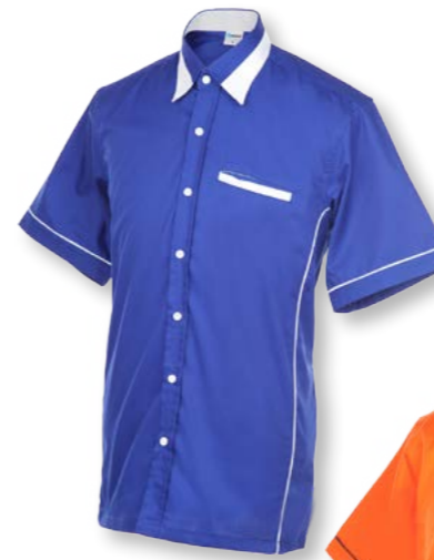
FC 2201 ROYAL BLUE / WHITE