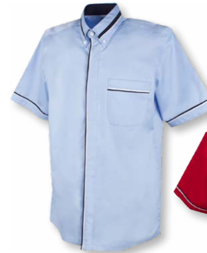
FC 2801 LIGHT BLUE / NAVY / WHITE