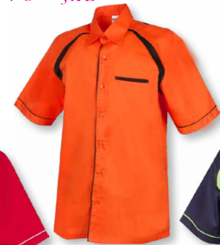
FC 2016 ORANGE / BLACK