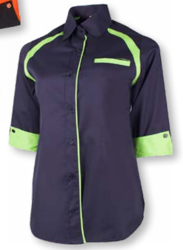
FC 2017 NAVY / APPLE GREEN