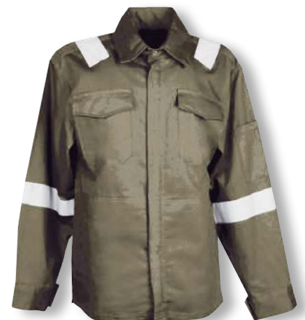
JK 5207 KHAKE