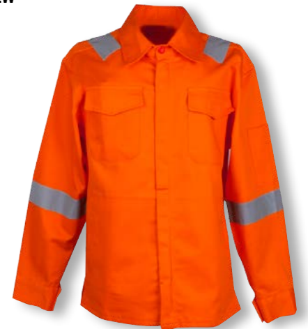
JK 5203 ORANGE