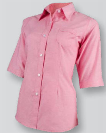
OF 1308 MAGENTA