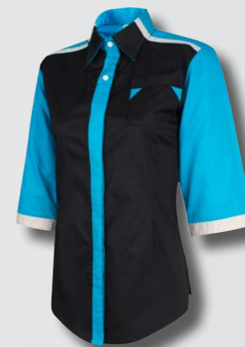
FC 3501 BLACK / CYAN / KHAKE