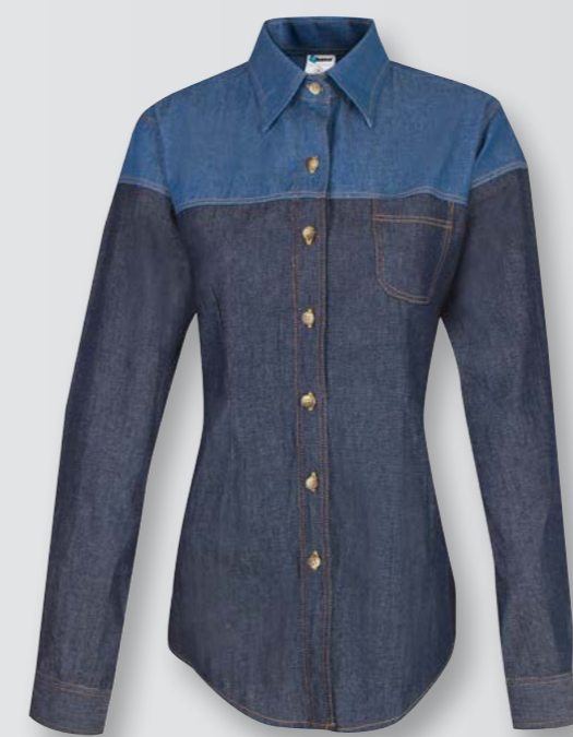
JL 08 NAVY / LIGHT BLUE