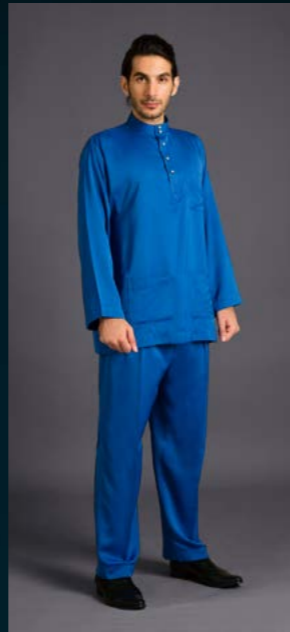
BM 02 ROYAL BLUE