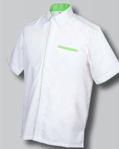
OF 1002 WHITE / APPLE GREEN