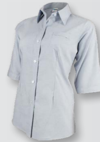
OF 1301 LIGHT GREY