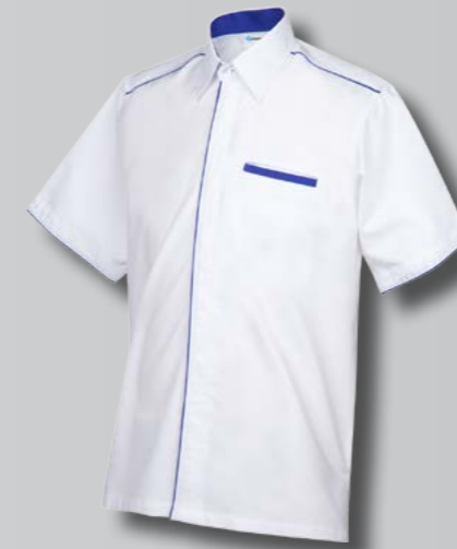
OF 1000 WHITE / ROYAL BLUE