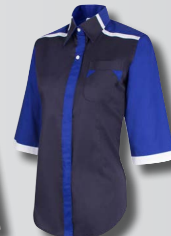
FC 3503 NAVY / ROYAL BLUE / KHAKE