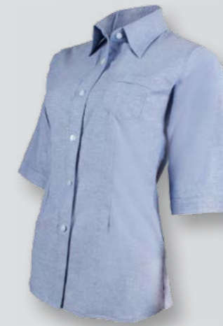
OF 1302 MEDIUM NAVY