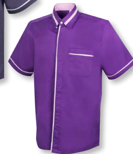
FC 2805 PURPLE / LIGHT PURPLE /WHITE