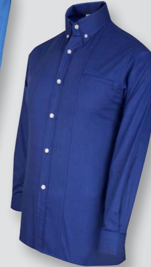
MY 0013 ROYAL BLUE