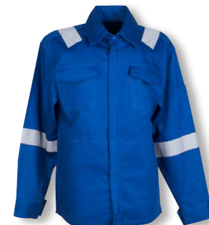
JK 5206 ROYAL BLUE