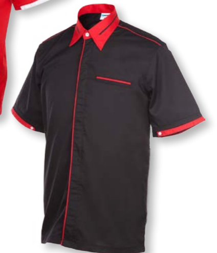
FC 2005 BLACK / RED