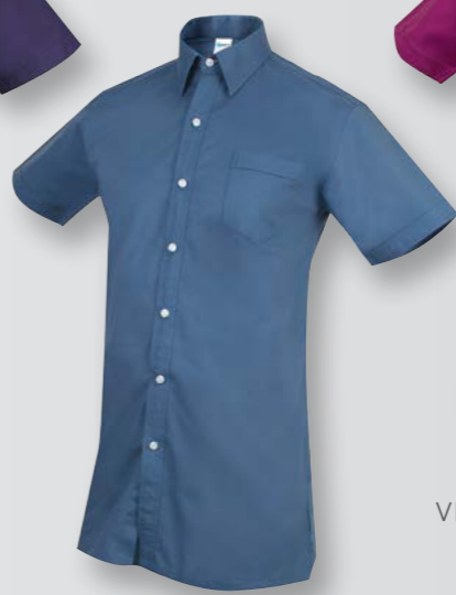
OF 1222 GREY BLUE