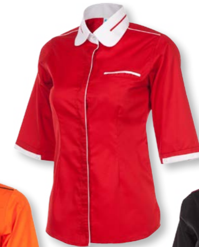
FC 2102 RED / WHITE