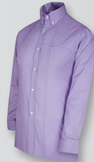
MY 0015 IRIS PURPLE