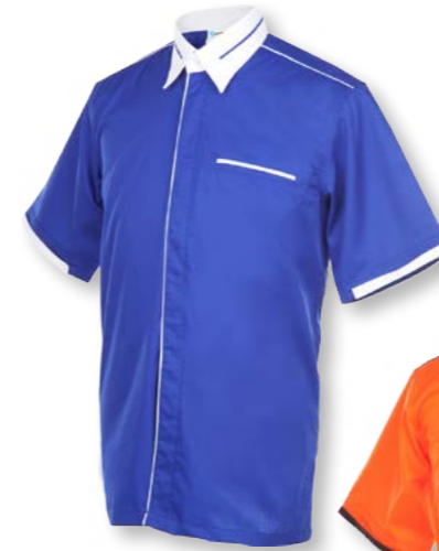
FC 2001 ROYAL BLUE / WHITE