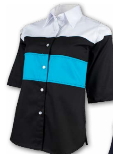
FC 2501 BLACK / WHITE / CYAN