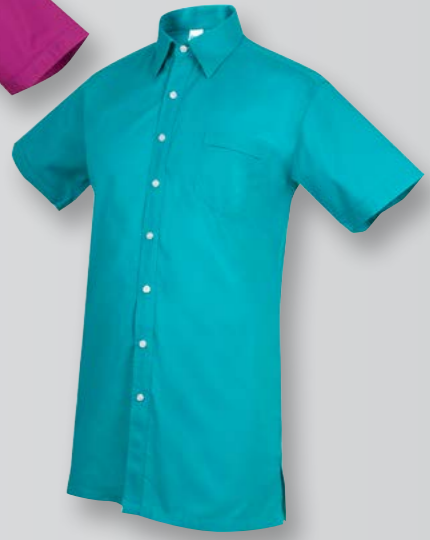
OF 1225 SAPPHIRE GREEN