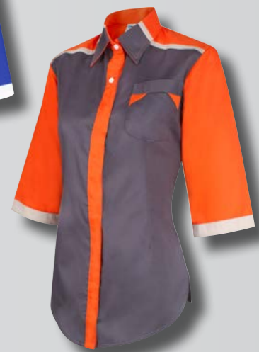
FC 3505 GREY / ORANGE / KHAKE