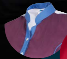
ROUND SHAPE (FEMALE)