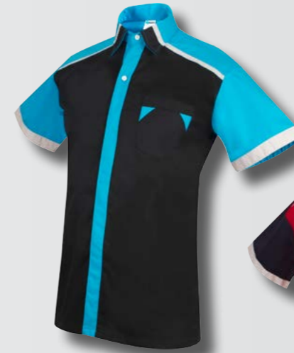
FC 3401 BLACK / CYAN / KHAKE