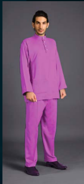
BM 05 MEDIUM PURPLE