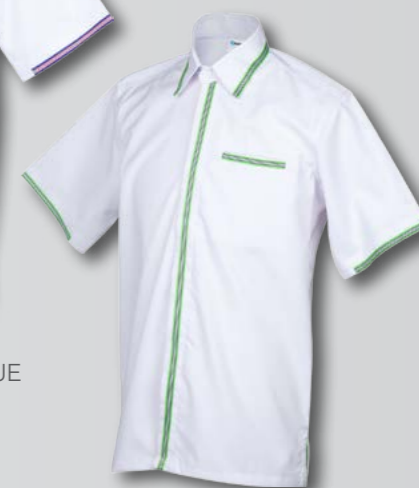
FV 3005 WHITE / GREEN