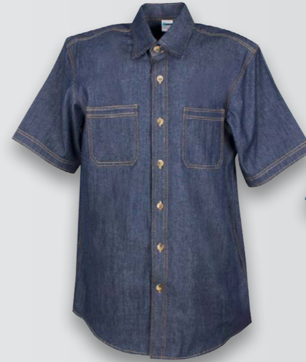
J 02 NAVY