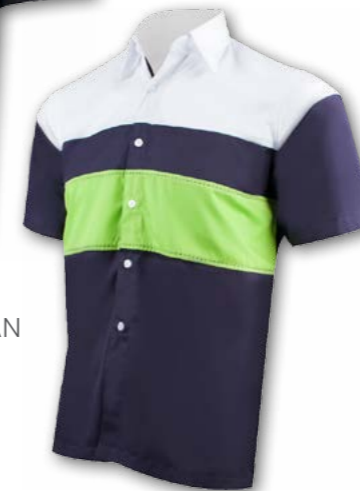
FC 2602 NAVY / WHITE / APPLE GREEN