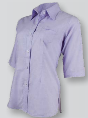
OF 1306 LIGHT PURPLE