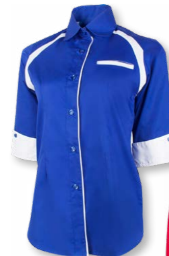
FC 2011 ROYAL BLUE / WHITE