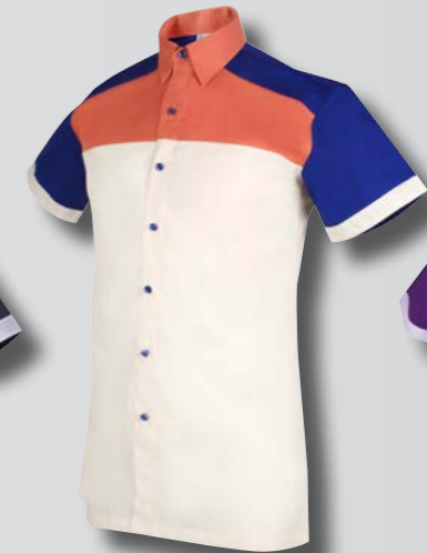
FC 3603 CREAM / PEACH / ROYAL BLUE