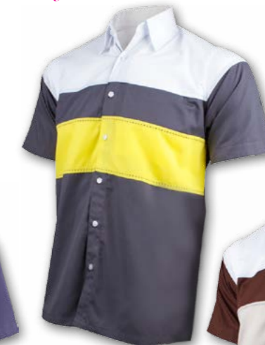
FC 2603 GREY / WHITE / YELLOW