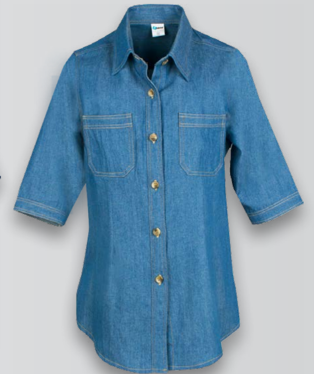
J 05 LIGHT BLUE