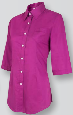
OF 1323 VIOLET PURPLE