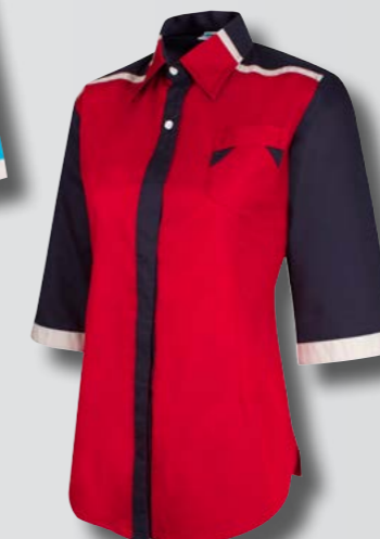
FC 3502 RED / NAVY / KHAKE