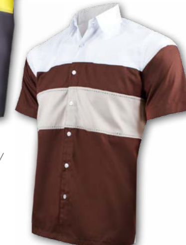
FC 2605 BROWN / WHITE / KHAKE