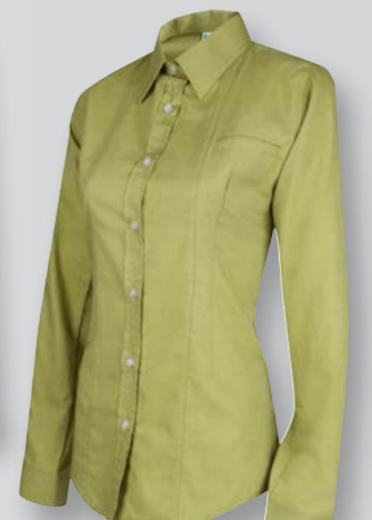
MY 0018 OLIVE GREEN