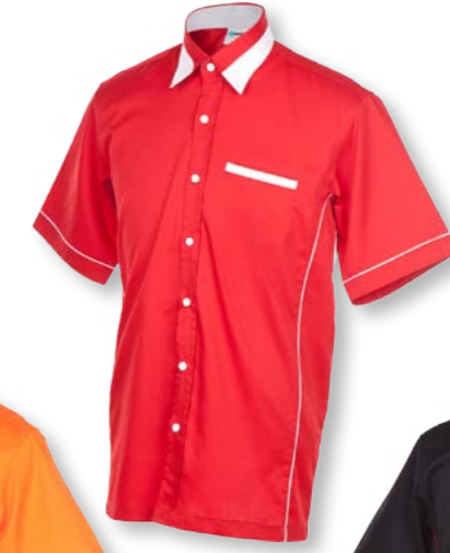
FC 2202 RED / WHITE