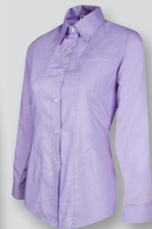
MY 0016 IRIS PURPLE