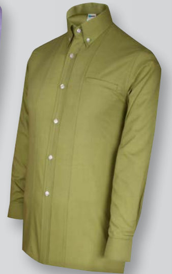
MY 0017 OLIVE GREEN