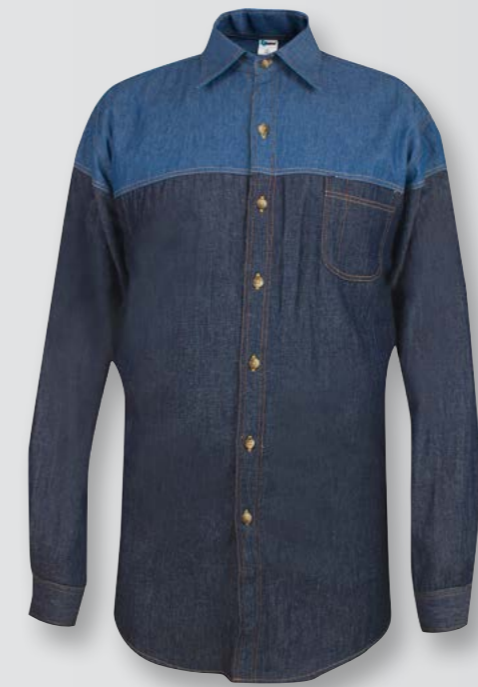
JL 07 NAVY / LIGHT BLUE