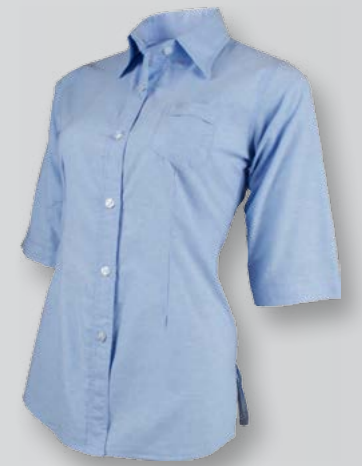
OF 1303 LIGHT BLUE