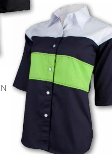
FC 2502 NAVY / WHITE / APPLE GREEN