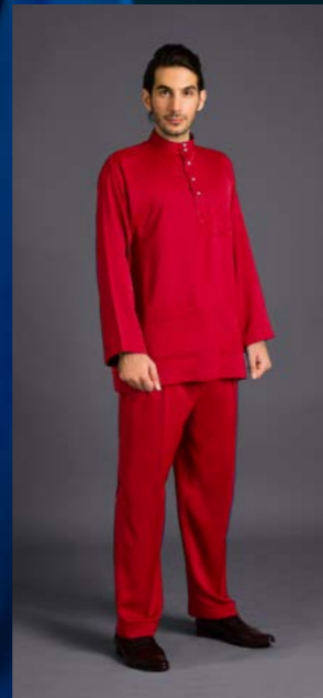
BM 03 RED