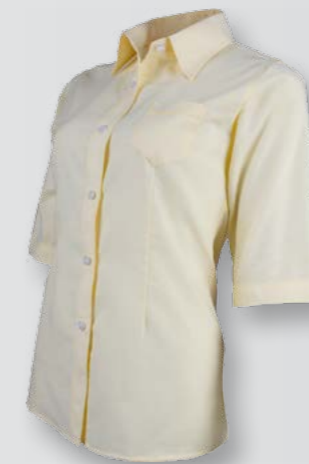
OF 1305 LIGHT YELLOW