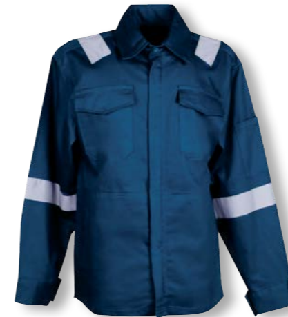
JK 5201 NAVY BLUE