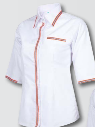
FV 3101 WHITE / ORANGE