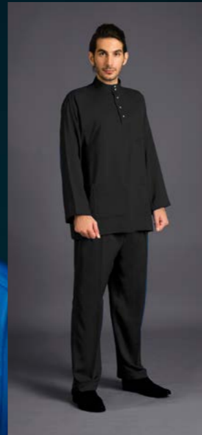
BM 01 BLACK