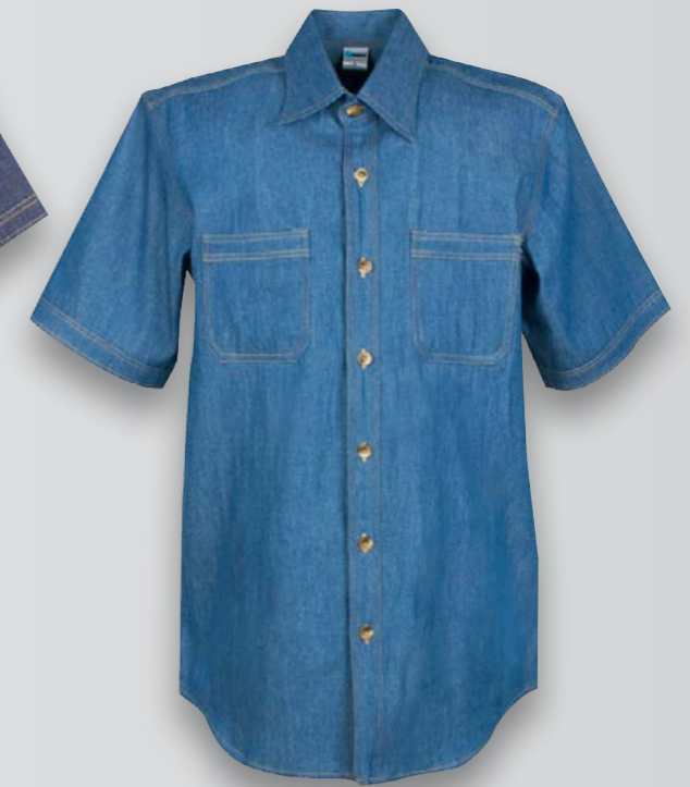
J 06 LIGHT BLUE