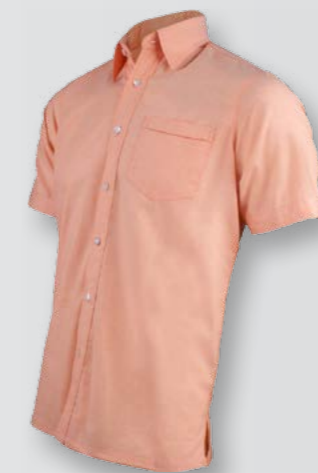
OF 1207 ORANGE