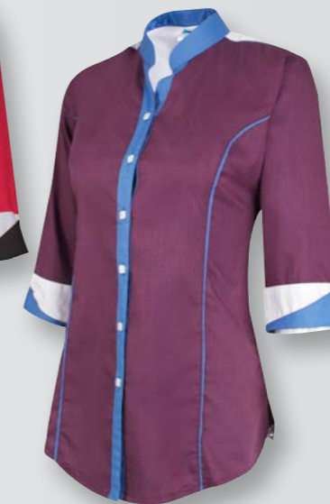
MY 1014 DARK PURPLE / MEDIUM BLUE / WHITE