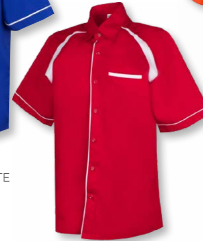
FC 2012 RED / WHITE