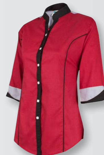
MY 1012 RED / BLACK / LIGHT GREY