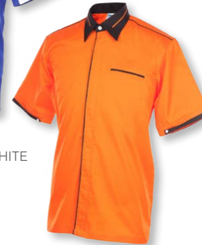
FC 2003 ORANGE / BLACK