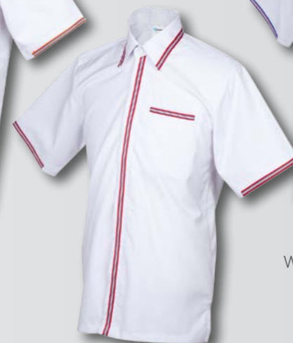
FV 3002 WHITE / RED