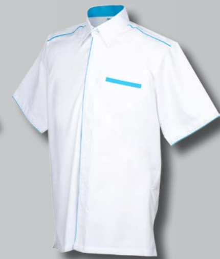
OF 1003 WHITE / CYAN