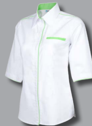
OF 1102 WHITE / APPLE GREEN