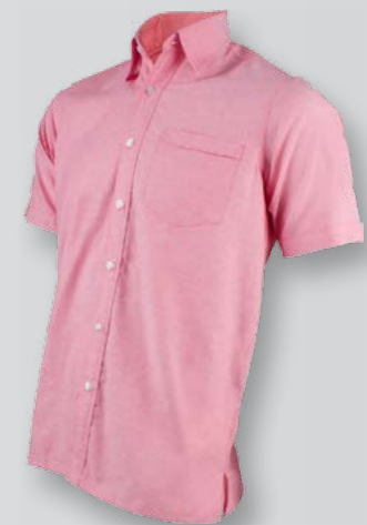
OF 1208 MAGENTA