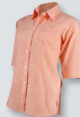
OF 1307 ORANGE