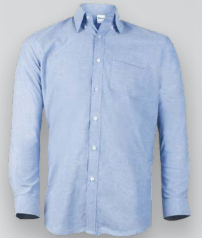
OF 1213 LIGHT BLUE