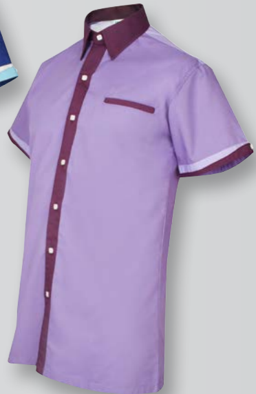
MY 1017 IRIS PURPLE / DARK PURPLE / LIGHT PURPLE