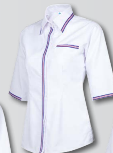
FV 3103 WHITE / ROYAL BLUE