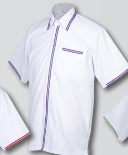
FV 3003 WHITE / ROYAL BLUE