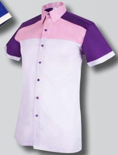
FC 3605 LIGHT PURPLE / MEDIUM PURPLE / DARK PURPLE