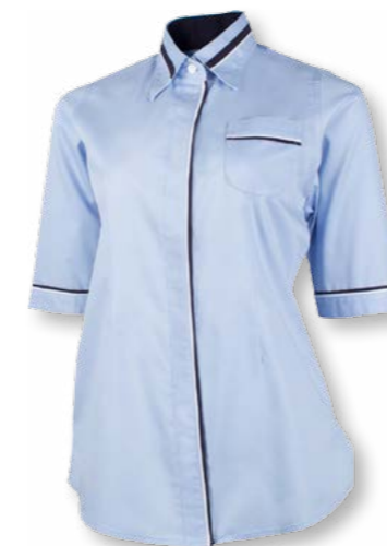
FC 2701 LIGHT BLUE / NAVY / WHITE