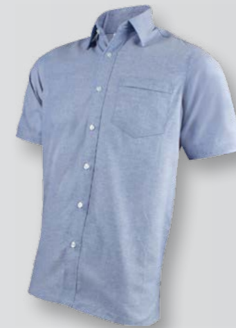
OF 1202 MEDIUM NAVY