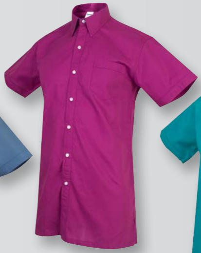
OF 1223 VIOLET PURPLE