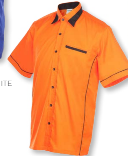
FC 2203 ORANGE / BLACK