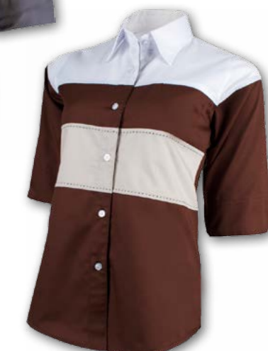
FC 2505 BROWN / WHITE / KHAKE