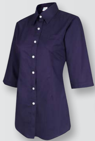
OF 1320 NAVY