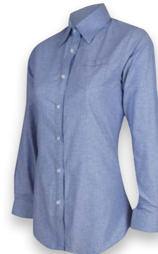
OF 1312 MEDIUM NAVY