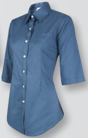
OF 1322 GREY BLUE