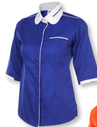
FC 2101 ROYAL BLUE / WHITE