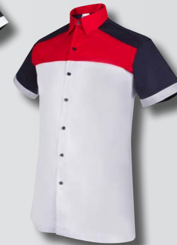
FC 3602 LIGHT GREY / RED / NAVY