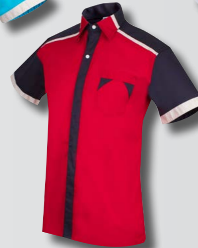
FC 3402 RED / NAVY / KHAKE