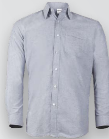
OF 1211 LIGHT GREY