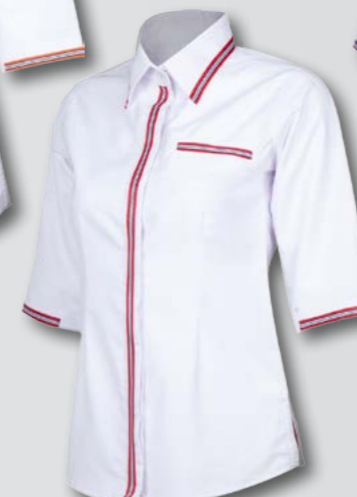
FV 3102 WHITE / RED