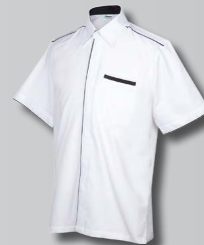
OF 1005 WHITE / BLACK