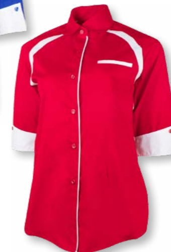
FC 2013 RED / WHITE ROUND SHAPE COLLAR