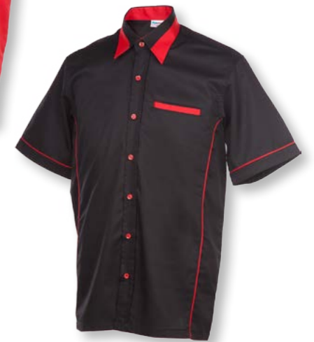
FC 2205 BLACK / RED