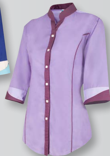
MY 1018 IRIS PURPLE / DARK PURPLE / LIGHT PURPLE