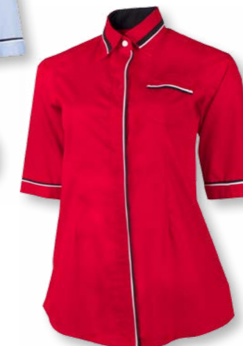
FC 2702 RED / BLACK / WHITE