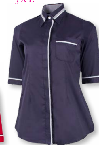
FC 2703 NAVY / GREY / WHITE