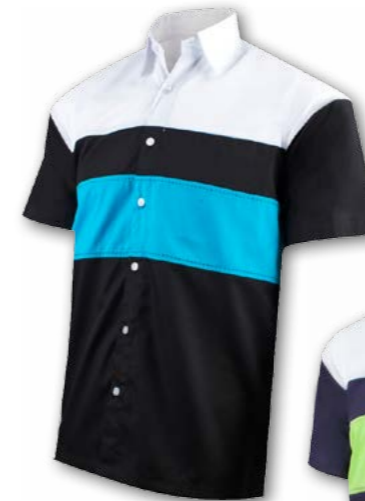
FC 2601 BLACK / WHITE / CYAN