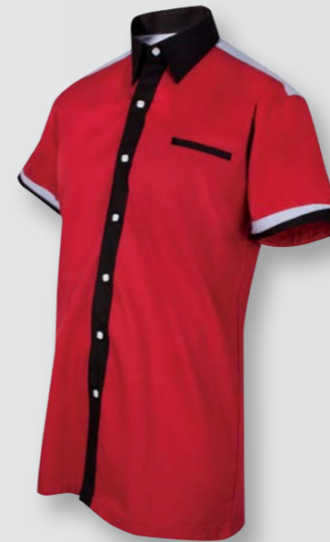
MY 1011 RED / BLACK / LIGHT GREY