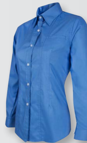
MY 0012 MEDIUM BLUE