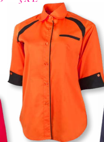
FC 2015 ORANGE / BLACK