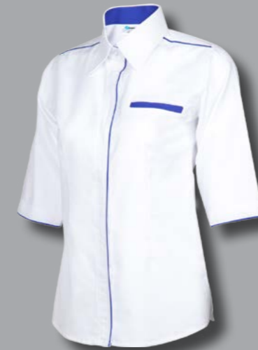
OF 1100 WHITE / ROYAL BLUE