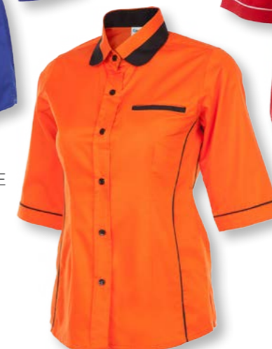
FC 2303 ORANGE / BLACK