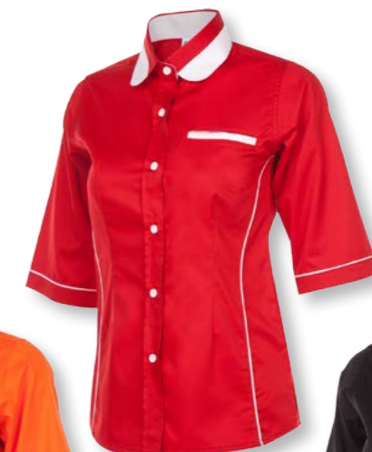
FC 2302 RED / WHITE