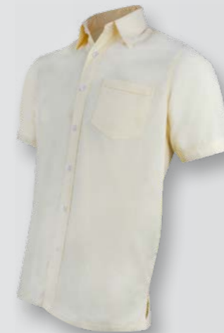
OF 1205 LIGHT YELLOW