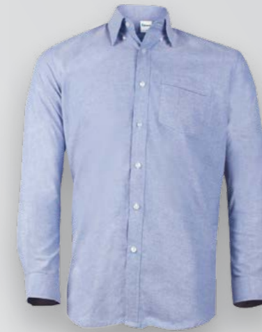
OF 1212 MEDIUM NAVY