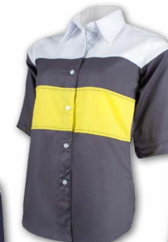
FC 2503 GREY / WHITE / YELLOW