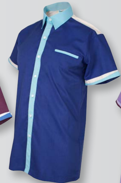
MY 1015 ROYAL BLUE / SKY BLUE / WHITE