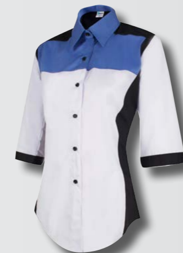
FC 3701 WHITE / MEDIUM BLUE / NAVY