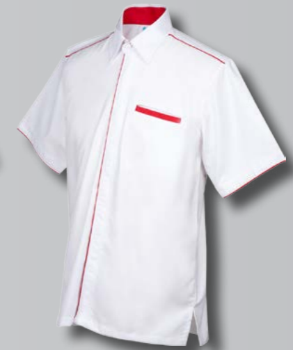
OF 1001 WHITE / RED