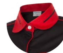
ROUND SHAPE COLLAR