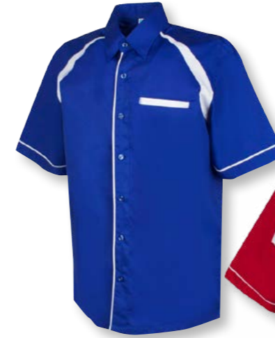
FC 2010 ROYAL BLUE / WHITE