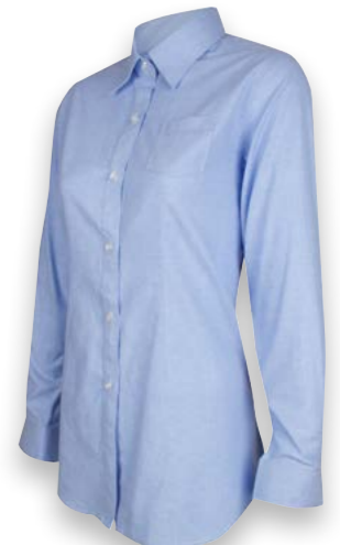
OF 1313 LIGHT BLUE