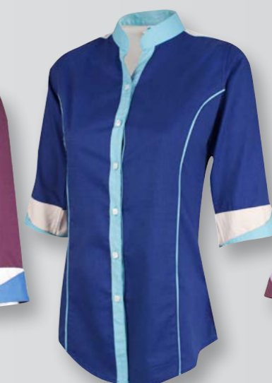
MY 1016 ROYAL BLUE / SKY BLUE / WHITE