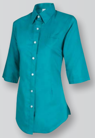
OF 1325 SAPPHIRE GREEN