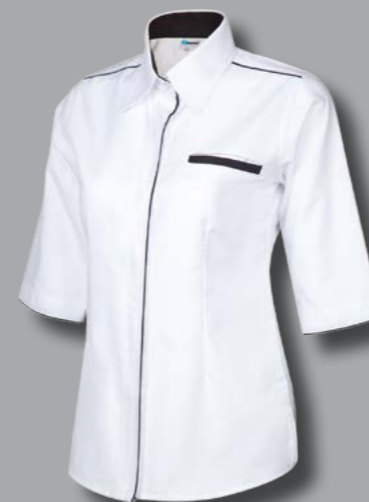
OF 1105 WHITE / BLACK