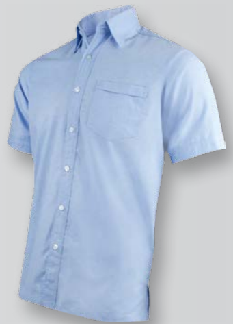
OF 1203 LIGHT BLUE