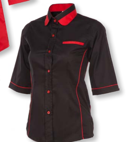
FC 2305 BLACK / RED