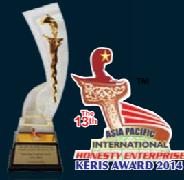
The Asia Pacific International Honesty Enterprise Keris Award