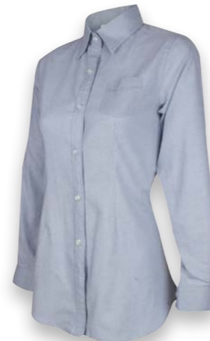
OF 1311 LIGHT GREY