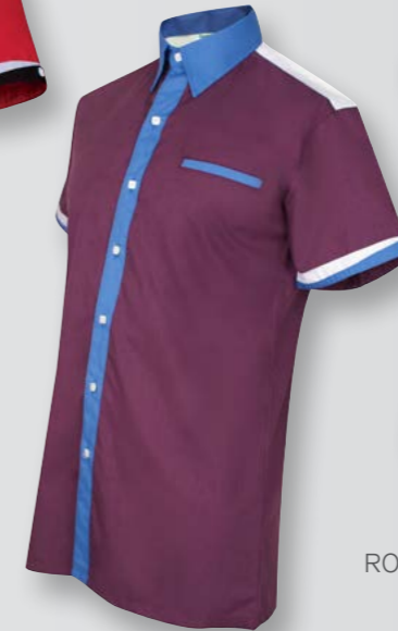
MY 1013 DARK PURPLE / MEDIUM BLUE / WHITE