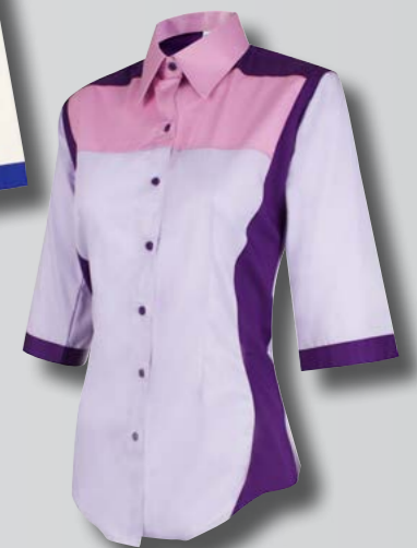
FC 3705 LIGHT PURPLE / MEDIUM PURPLE / DARK PURPLE