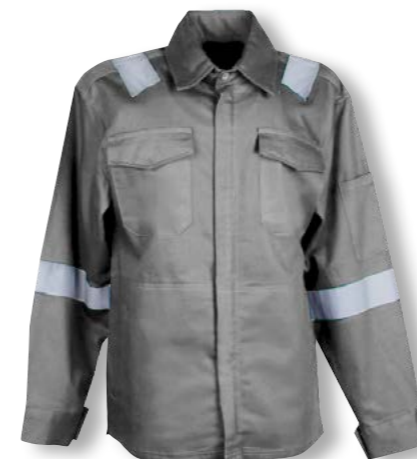
JK 5205 GREY