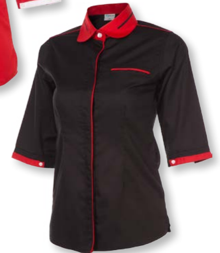
FC 2105 BLACK / RED