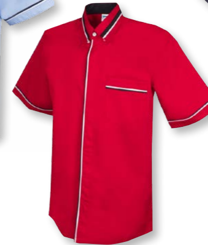
FC 2802 RED / BLACK / WHITE