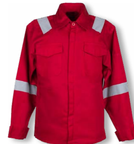
JK 5202 RED