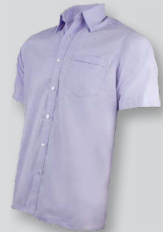
OF 1206 LIGHT PURPLE