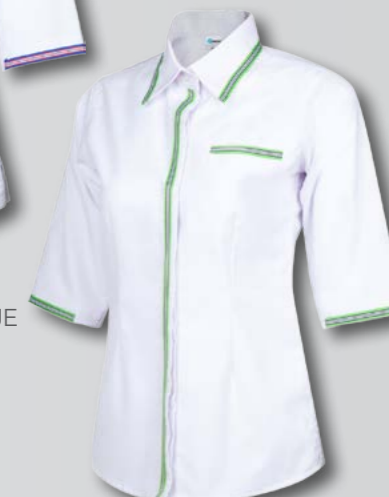
FV 3105 WHITE / GREEN