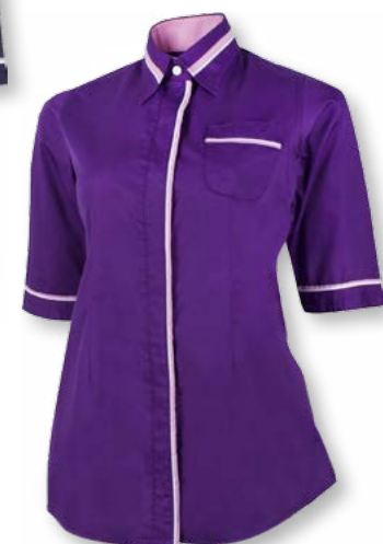
FC 2705 PURPLE / LIGHT PURPLE /WHITE