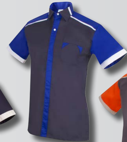
FC 3403 NAVY / ROYAL BLUE / KHAKE