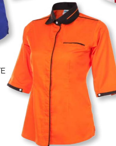
FC 2103 ORANGE / BLACK