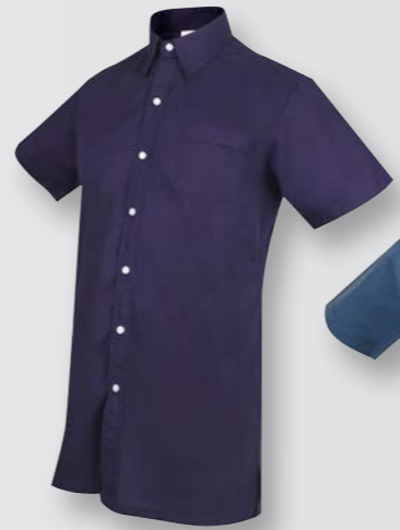
OF 1220 NAVY