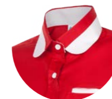
ROUND SHAPE COLLAR