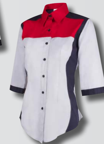
FC 3702 LIGHT GREY / RED / NAVY