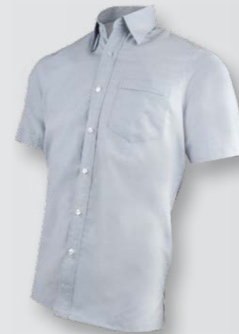
OF 1201 LIGHT GREY