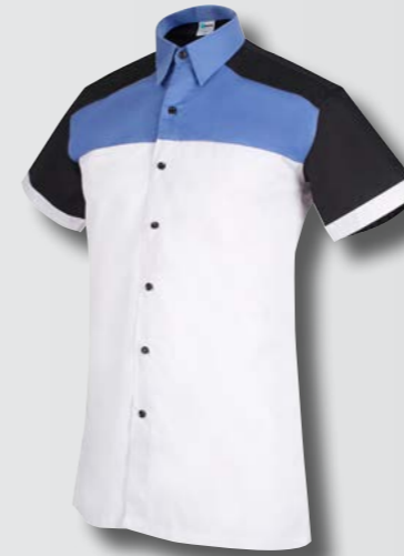
FC 3601 WHITE / MEDIUM BLUE / NAVY