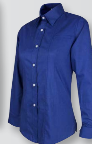
MY 0014 ROYAL BLUE