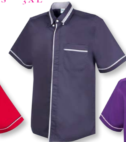
FC 2803 NAVY / GREY / WHITE