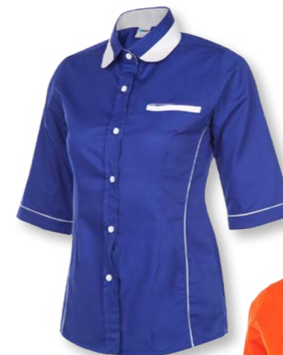
FC 2301 ROYAL BLUE / WHITE