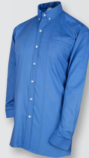
MY 0011 MEDIUM BLUE