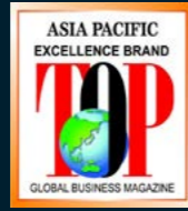
AWARDED ASIA PACIFIC TOP EXCELLENCE BRAND (Emerging Enterprise)