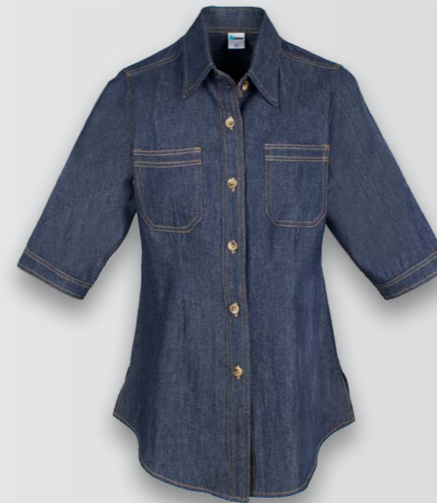
J 03 NAVY