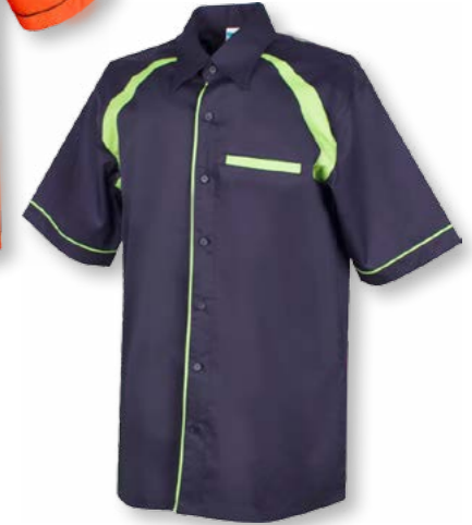
FC 2018 NAVY / APPLE GREEN