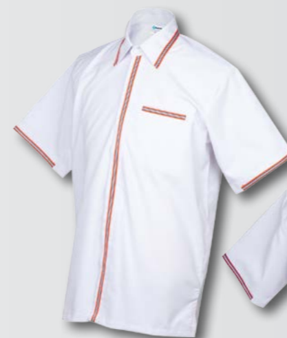
FV 3001 WHITE / ORANGE