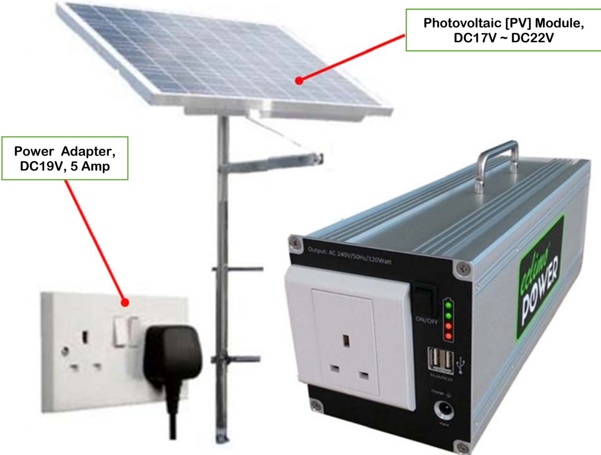
Photovoltaic [PV] Module, DC17V ~ DC22V