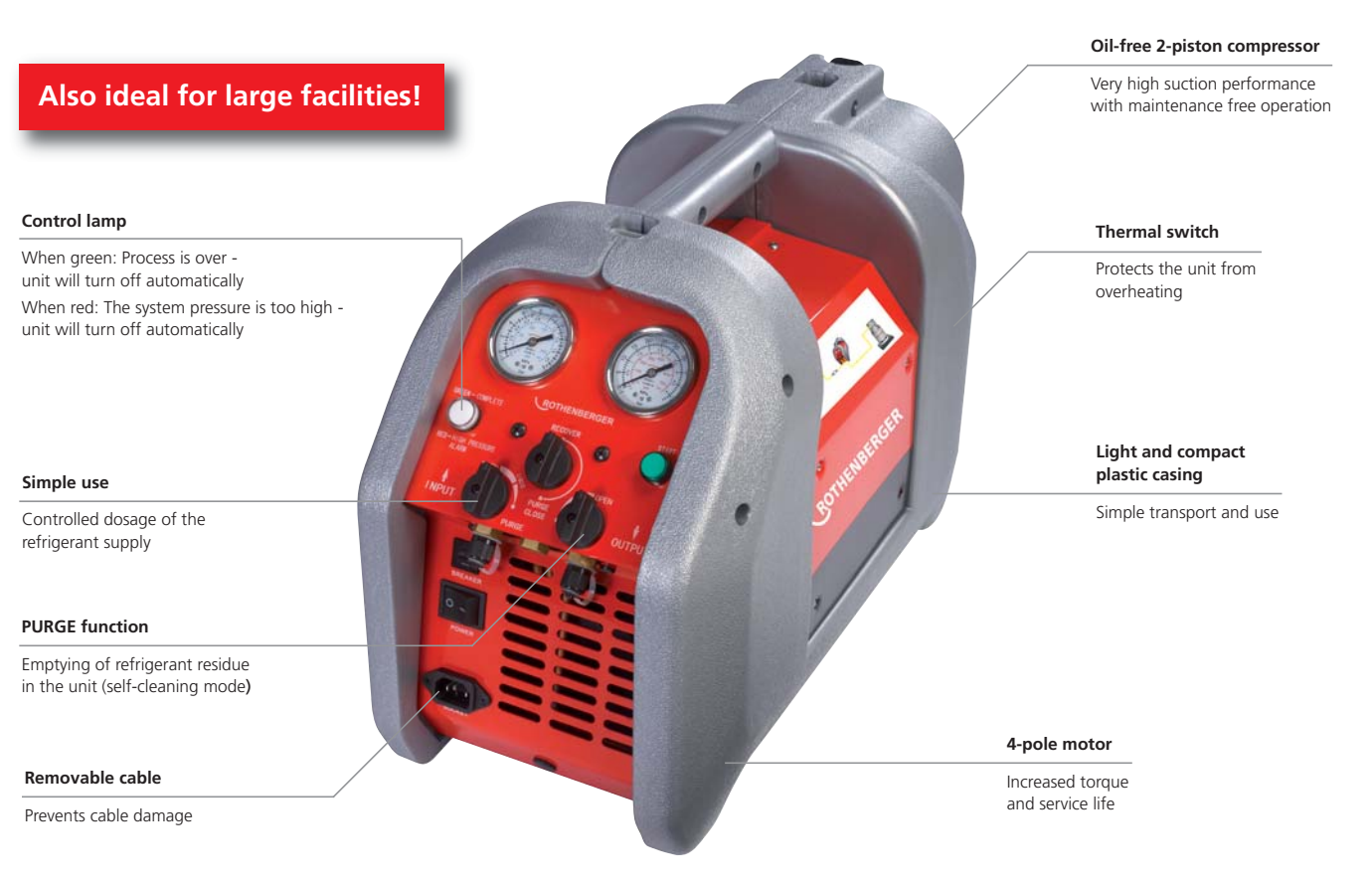
Simple and precise reading with the glycol filled pressure gauge