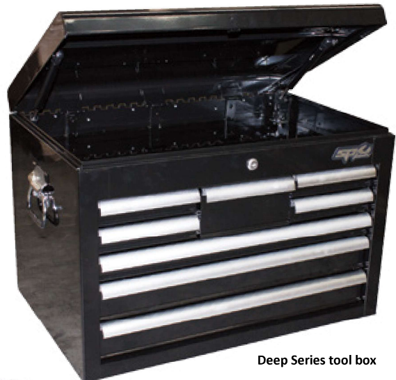
Deep Series tool box