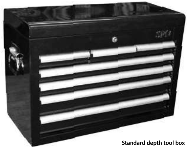
Standard depth tool box