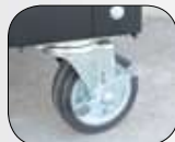
Lockable swivel castors