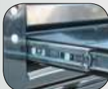
Smooth roller bearing sliders