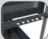
Screwdriver slots on both sides of trolley