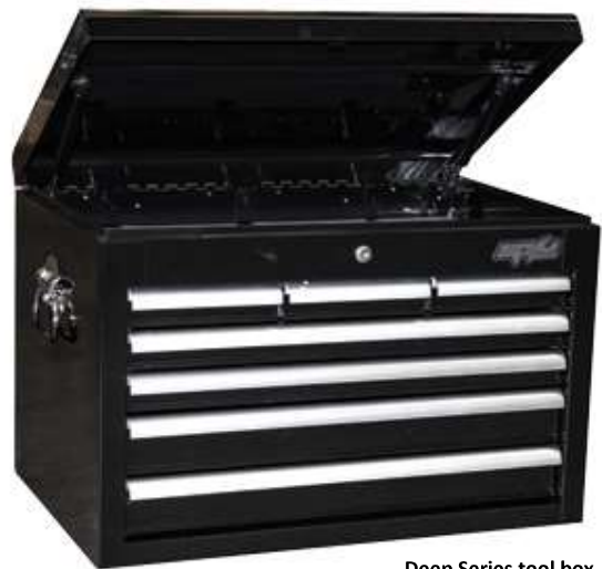
Deep Series tool box