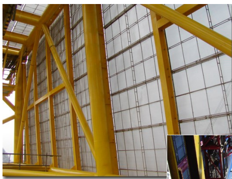
Ladder Heatshields protecting personnel working within the turret area on FPSO KIKEH