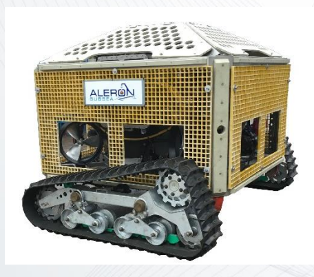
Above is AUXROV Connected to Hydraulic Tracks for high current or fixed seabed applications