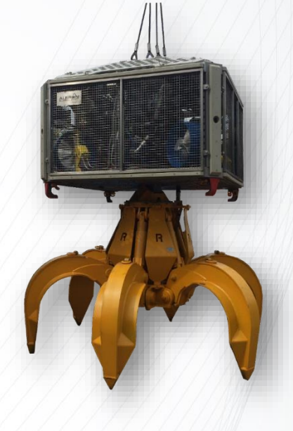
Above is the AUXROV shown with a 6 Tine grab and below is the clam shell grab.