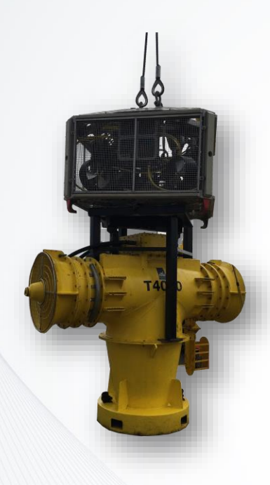
Above is the AUXROV Connected to the T4000 MFE