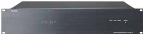
FV-224PA Power Amplifier