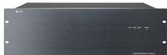
FV-248PA Power Amplifier

- Specification measured at AC 230V AC, 50Hz