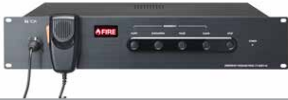
FV-200EV Emergency Message Panel