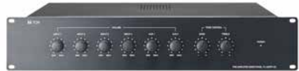
FV-200PP Pre-Amplifier Mixer Panel