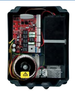
24V Wingo and Toona Control Unit