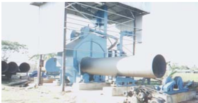
Large diameter Model P9040