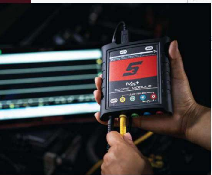
EEMS348EUR ZEUS™+ Intelligent Diagnostics and Information System