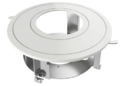
DS-1227ZJ-DM42 In-Ceiling Mount