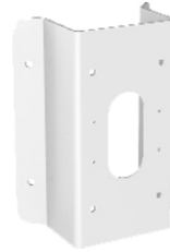
DS-1476ZJ-Y Corner Mount