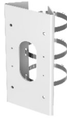
DS-1475ZJ-Y Vertical Pole Mount