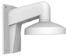
DS-1473ZJ-155-Y Pendant Mount