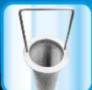
No Consumables - Stainless Steel Filter