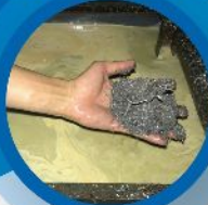
Uncleaned - Aluminum Scrap