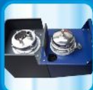
Precision Filter - Filter Bucket

Chip / Sludge Removal Machine - Optional - Precision Type