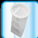
Consumables - Filter Bags