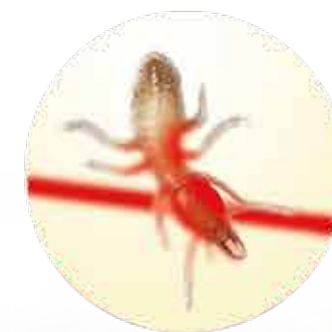
Slow knock down effect at the recommended rate