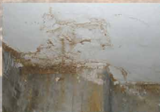
Damage to Wall