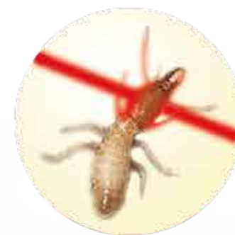
Non-repellent; Termite infected without notice