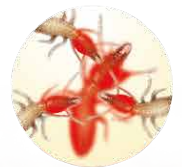
Transferred PREMINATOR® will affect the entire colony