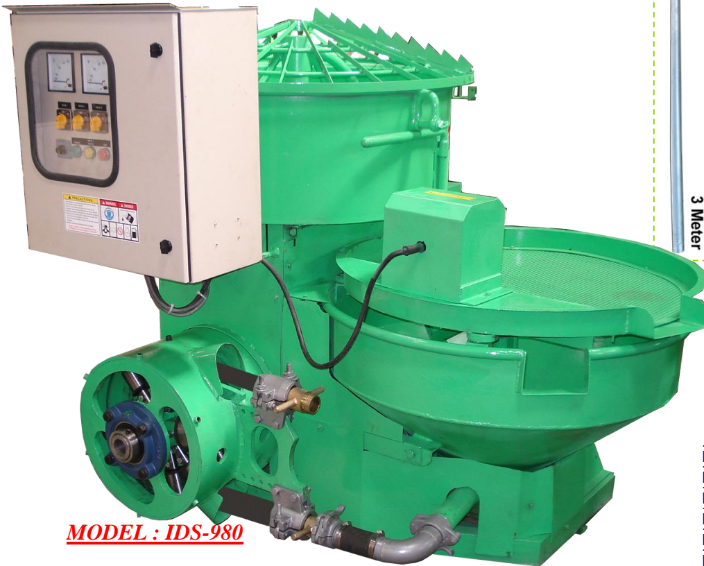
MODEL : IDS-980