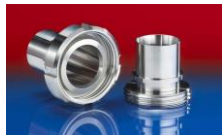
CONNECT DAIRY FITTING 247