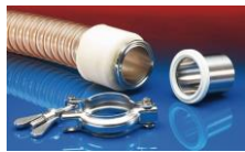
CONNECT TRI-CLAMP FITTING 245