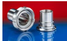
CONNECT ASEPTIC FITTING 249