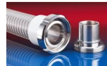
CONNECT MOULD ASSEMBLY 233