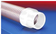
CONNECT 240 + 241 FOOD