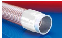
CONNECT 243 FOOD