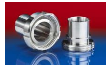
CONNECT DAIRY FITTING 247