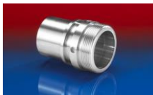
CONNECT THREAD FITTING 234