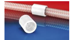
CONNECT 246 FOOD