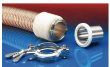
CONNECT TRI- CLAMP FITTING 245