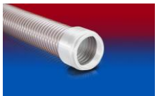
CONNECT 245 FOOD