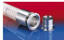
CONNECT PRESS ASSEMBLY 232