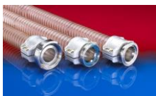
CONNECT SAFETY CLAMP ASSEMBLY 231