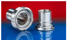
CONNECT ASEPTIC FITTING 249