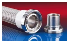
CONNECT MOULD ASSEMBLY 233