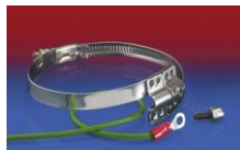
CLAMP 212 EC