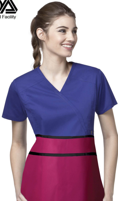
Semi Guard Hook & Loop Closure

Manufactured in an FDA Registered Facility