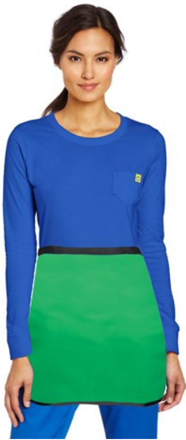
Lap Guard 1" buckle Closure

Manufactured in an FDA Registered Facility