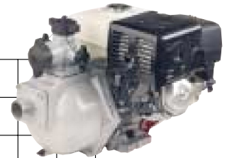
Blazemaster Twin BM70Y