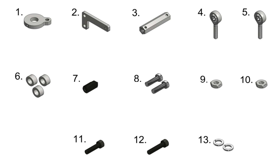
Figure 1: Pieces Supplied with the AGA92.1 Manual Kit

Figure 1 shows the components supplied with the AGA92.1 manual kit: