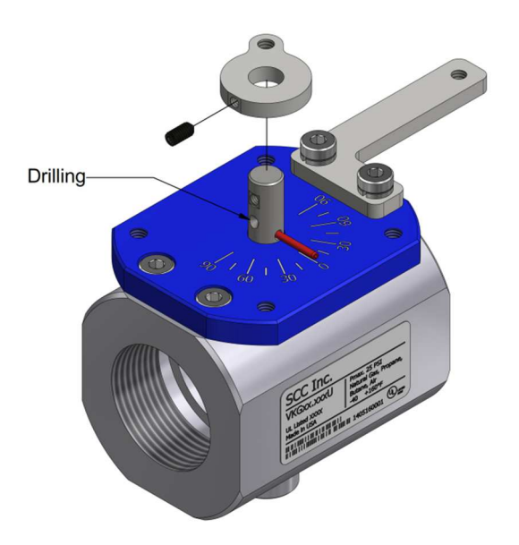
Figure 3: Crank Arm Installation

2. Slide the crank arm over the valve shaft in the orientation shown in Figure 3. Rotate it so that the threaded hole in the crank arm lines up with the drilling in the valve shaft. Using a 5/64" hex key and the #8-32 set screw, fasten the crank arm to the valve shaft.