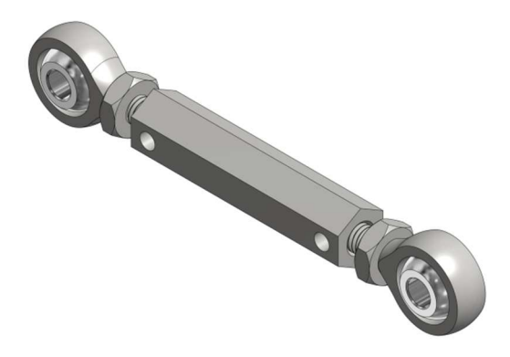
Figure 4: Turnbuckle Assembly

3. Thread the #10-32 right-hand hex nut as far as possible onto the #10-32 right-hand rod end by hand. Do the same with the #10-32 left-hand hex nut and rod end. Next, thread each rod end into the turnbuckle approximately 19 full turns by hand. One of the holes in the turnbuckle has right-hand threads while the other hole has left-hand threads. When complete, the turnbuckle assembly should look like Figure 4 below.