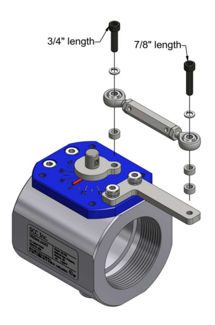
Figure 5: Turnbuckle Assembly Installation

4. Install the turnbuckle assembly onto the valve using a 5/32" hex key, the #10-24 x 3/4" socket cap screw, the #10-24 x 7/8" socket cap screw, the (3) #10 spacers, and the (2) #10 split lock washers as shown below in Figure 5. The 3/4" length socket cap screw threads into the crank arm and uses (1) #10 spacer. The 7/8" length socket cap screw threads into the mounting bracket and uses (2) #10 spacers. The valve shaft may need to be turned slightly so that the hole in the crank arm lines up with the hole in one of the rod ends on the turnbuckle assembly.