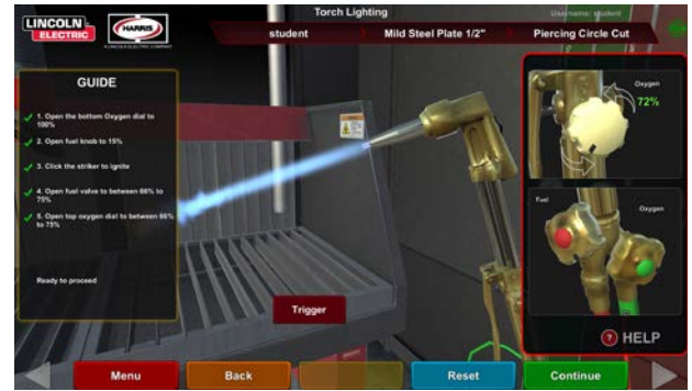
Correctly Set Torch