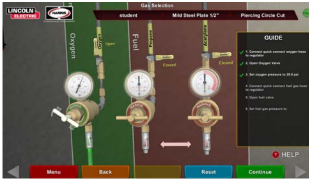
Choose from Multiple Fuels