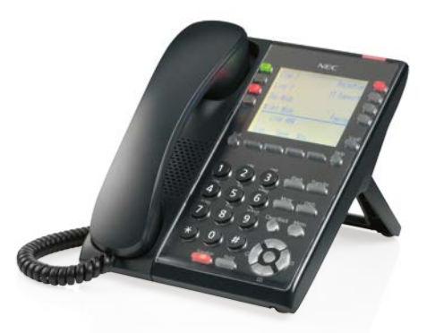
SL2100 IP Terminal