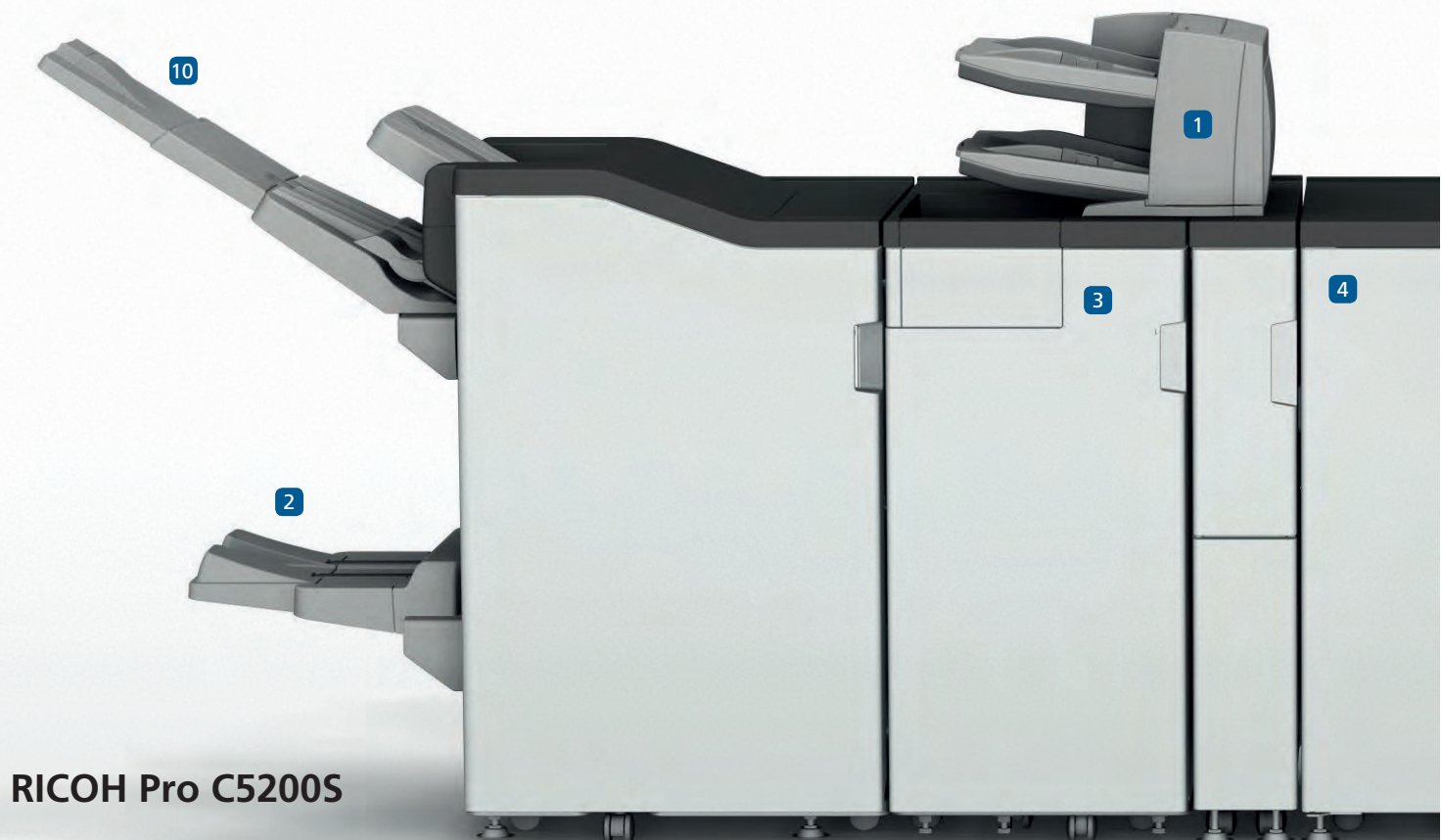
RICOH Pro C5200S