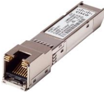
Table 1. MGE SFP transceiver modules