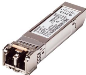
Figure 1. Cisco optical Gigabit Ethernet SFP module

The Cisco MGE transceivers provide fast, reliable connectivity between switches located on different floors, in separate buildings, or on a small campus network needing connectivity between sites. These transceivers can support Gigabit Ethernet applications. Figures 1 and 2 show the fiber-optic and copper transceivers. Table 1 lists the transceiver modules.