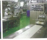
To kill bacteria on food processing machines