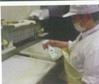
To kill bacteria on cooking tools