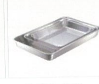
To kill bacteria on trays