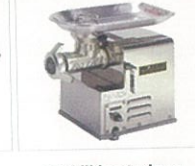
To kill bacteria on meat choppers