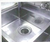
To kill bacteria on sinks