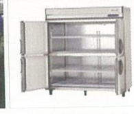
To kill bacteria and odor inside the refrigerators and handrails