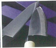
To kill bacteria on kitchen knives and cooking tools