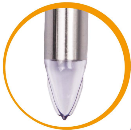
■ Optical tip