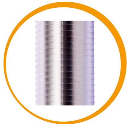
■ Threaded design