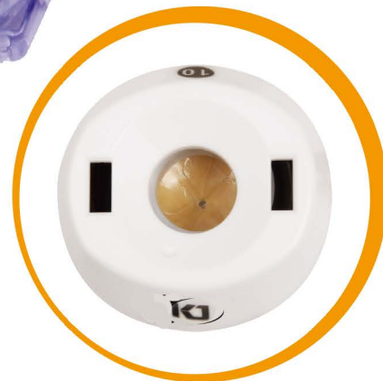
■ Universal seal