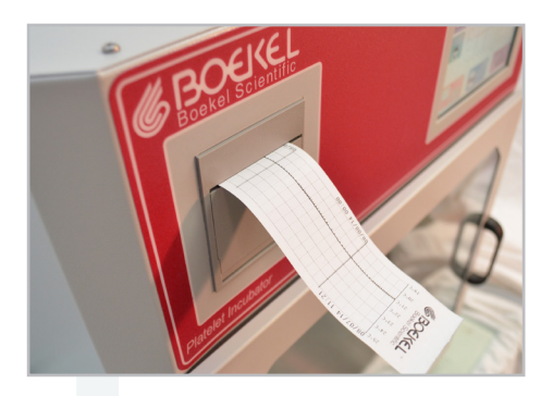
On-Board Thermal Printer for Event Log and Temperature Record Keeping