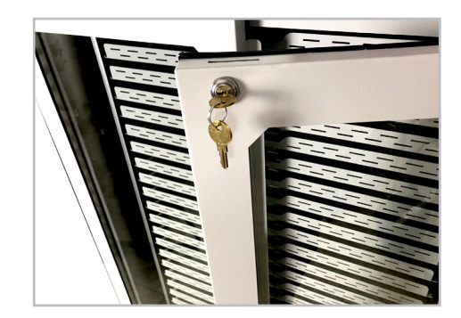
Locking Double Door Design for Quarantined Material