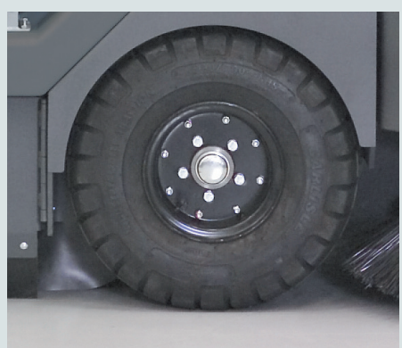
The large wheels give a smoother ride