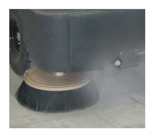
The exclusive DustGuard™ system effectively controls airborne dust by providing a fine mist of moisture to the front and side brushes