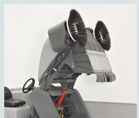
The SW8000 has a superb high-dump capability up to 152 cm from ground level for easy and convenient emptying