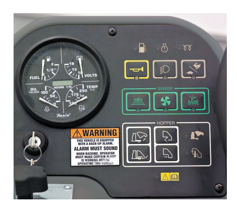
Operation of the SW8000 could not be easier. One-Touch™ control shortens operator-training time and improves the cleaning result