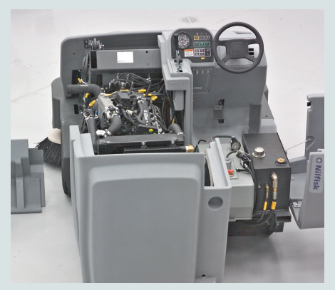
The Nilfisk NoTools™ system makes service extremely easy. The 5-sided access to engine and hydraulic components saves you valuable time and keeps down the service cost