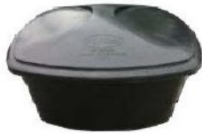
POLYTANK® KING KONG