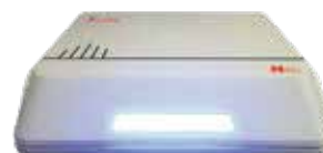
Blue Successful read card