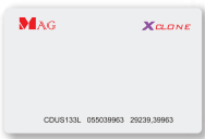
CDUS133L Anti inteferece UHF card.