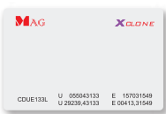
CDUE133L Dual frequency card. UHF & EM 125 Khz.