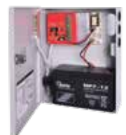
NVS1230P Power Supply