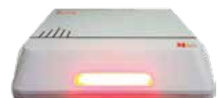
Red Power on