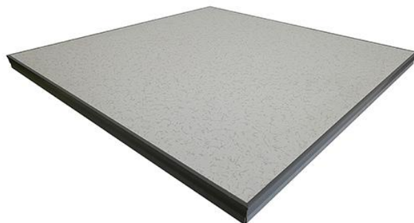
Woodcore panel c/w HPL finishing