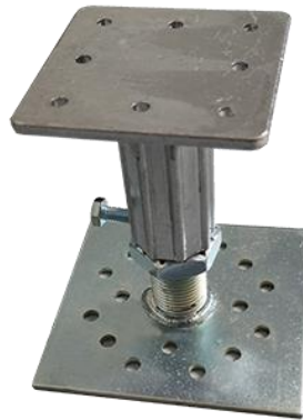
Rigid grid system