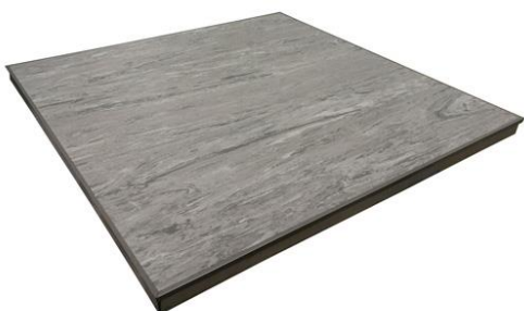
Woodcore panel c/w vinyl finishing