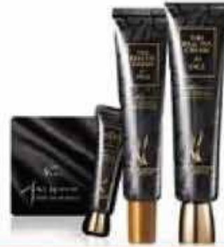
AHC Eye Cream