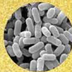
Lactic Acid Bacteria, LAB