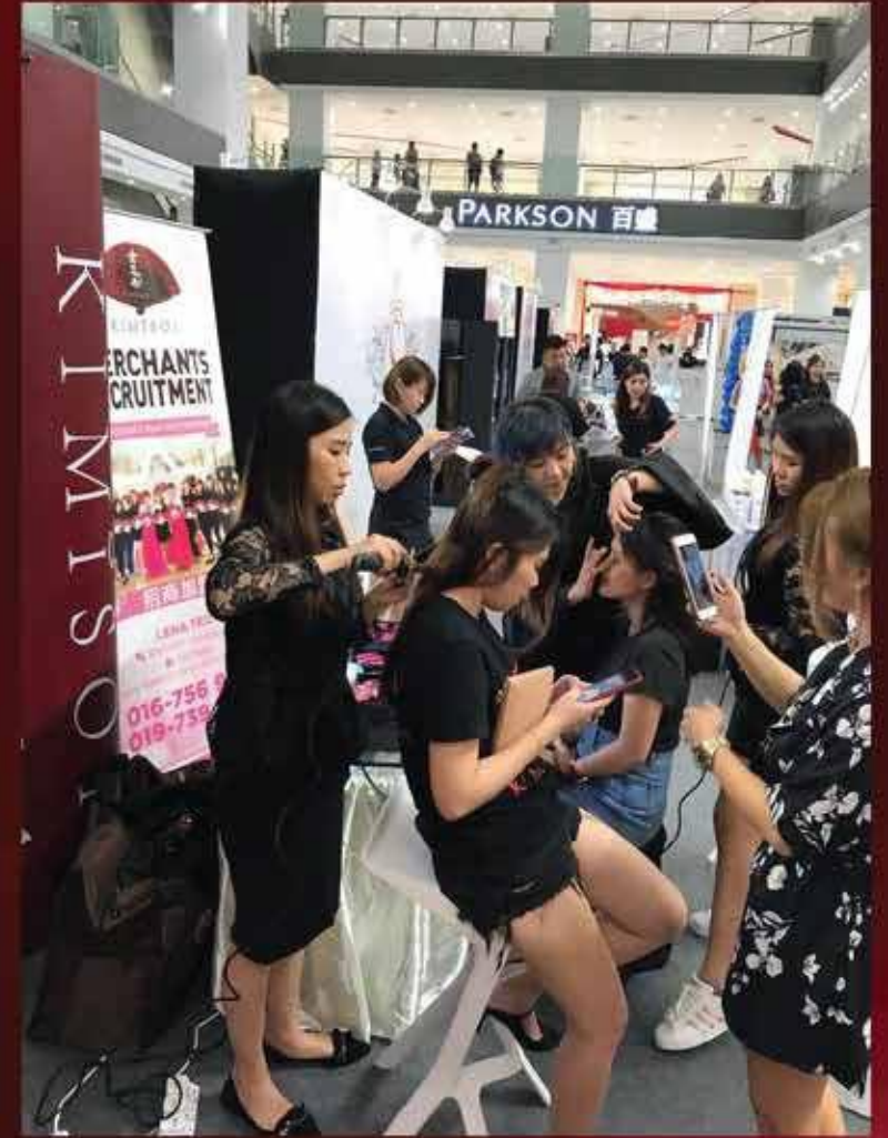
Online and offline customer service assistance.