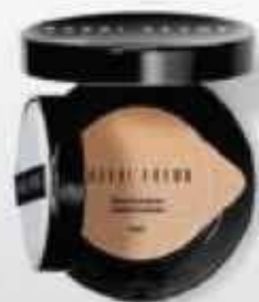
Bobbi Brown Cushion Foundation