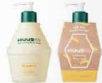
Round Around Banana Milk Line