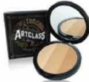
Too cool for school Shading Shadow