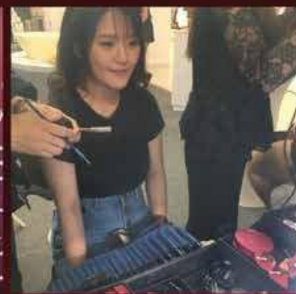
Regular launch of custom rewards and promotions.