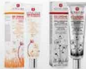
Erborian BB Cream / CC Cream