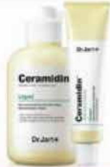
Dr.Jart Ceramidin Line