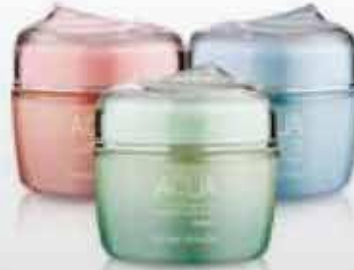
Nature Republic Moisturizing Cream