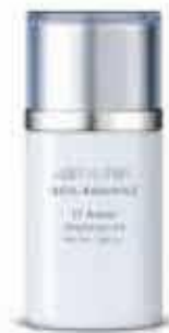
AMWAY Artistry Sunscreen