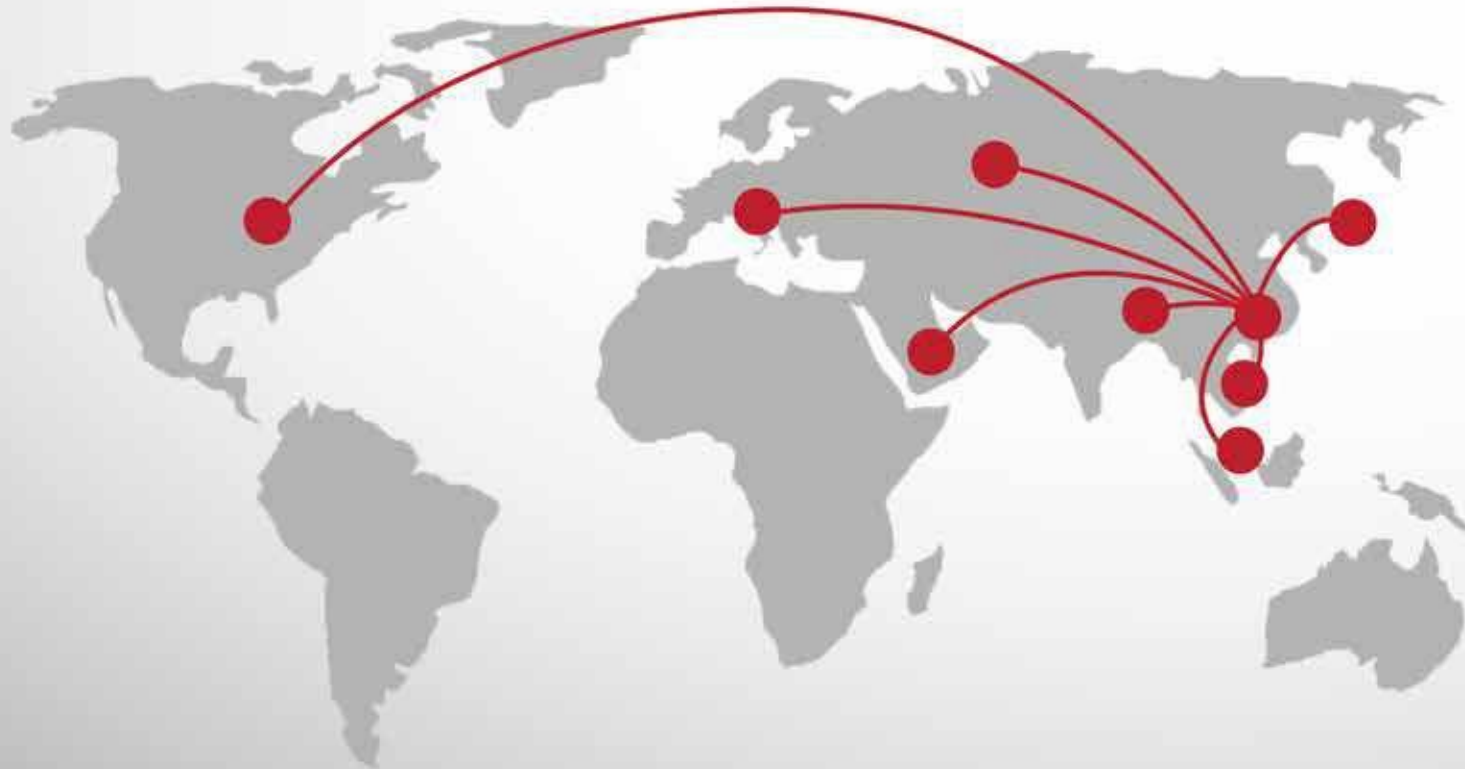
Global Client & Platform

M&L LABORATOIRES TONY MOLY LVMH MOËT HENNESSY · LOUIS VUITTON