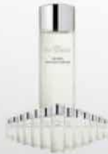
MISSHIA First Treatment Essence