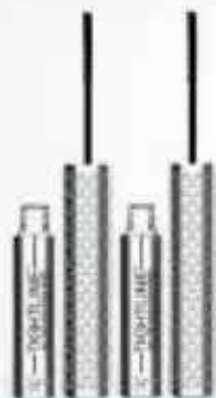
it cosmetics Tightline Masacara