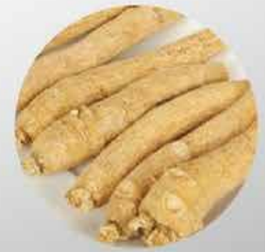
Incarvillea grandiflora Bur.et Franch