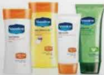
Unilever Vaseline Suncare