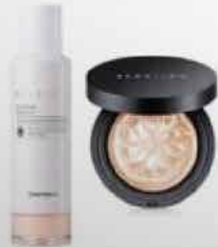
TONYMOLY BCDATION Serum / Balm