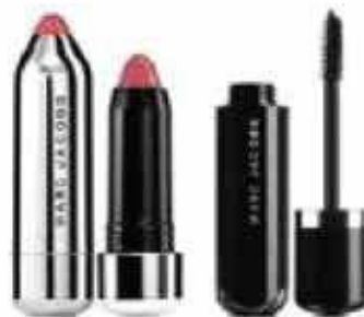
MARC JACOBS Lipstick / Mascara