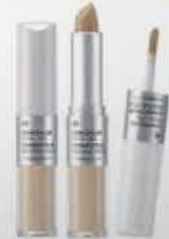
THE FACE SHOP Dual Concealer