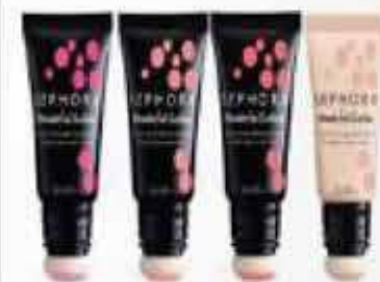
Sephora Cushion Blush / Highlighter