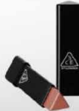
STYLENANDA 3CE Lipstick