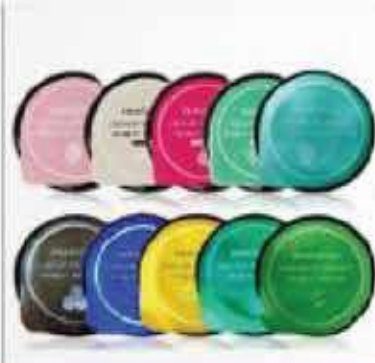
Innisfree Capsule Pack