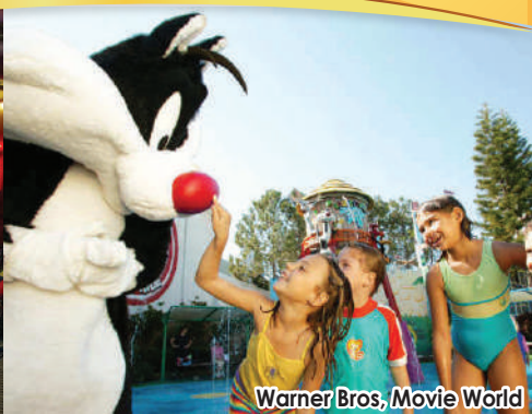
Warner Bros, Movie World