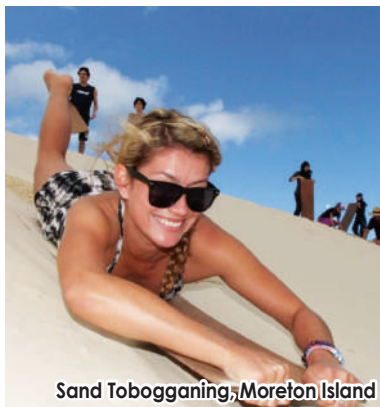
Sand Tobogganing, Moreton Island