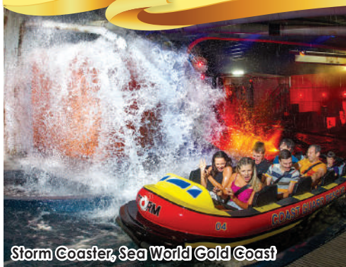
Storm Coaster, Sea World Gold Coast