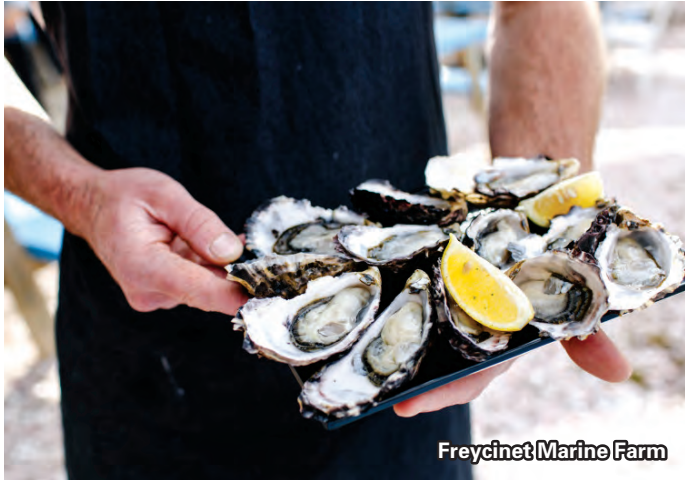
Freycinet Marine Farm