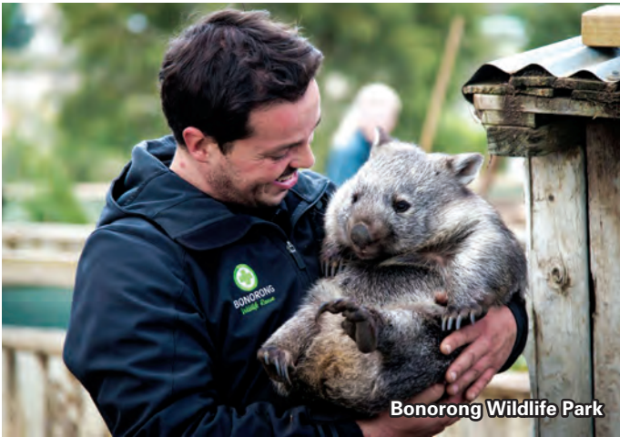
Bonorong Wildlife Park