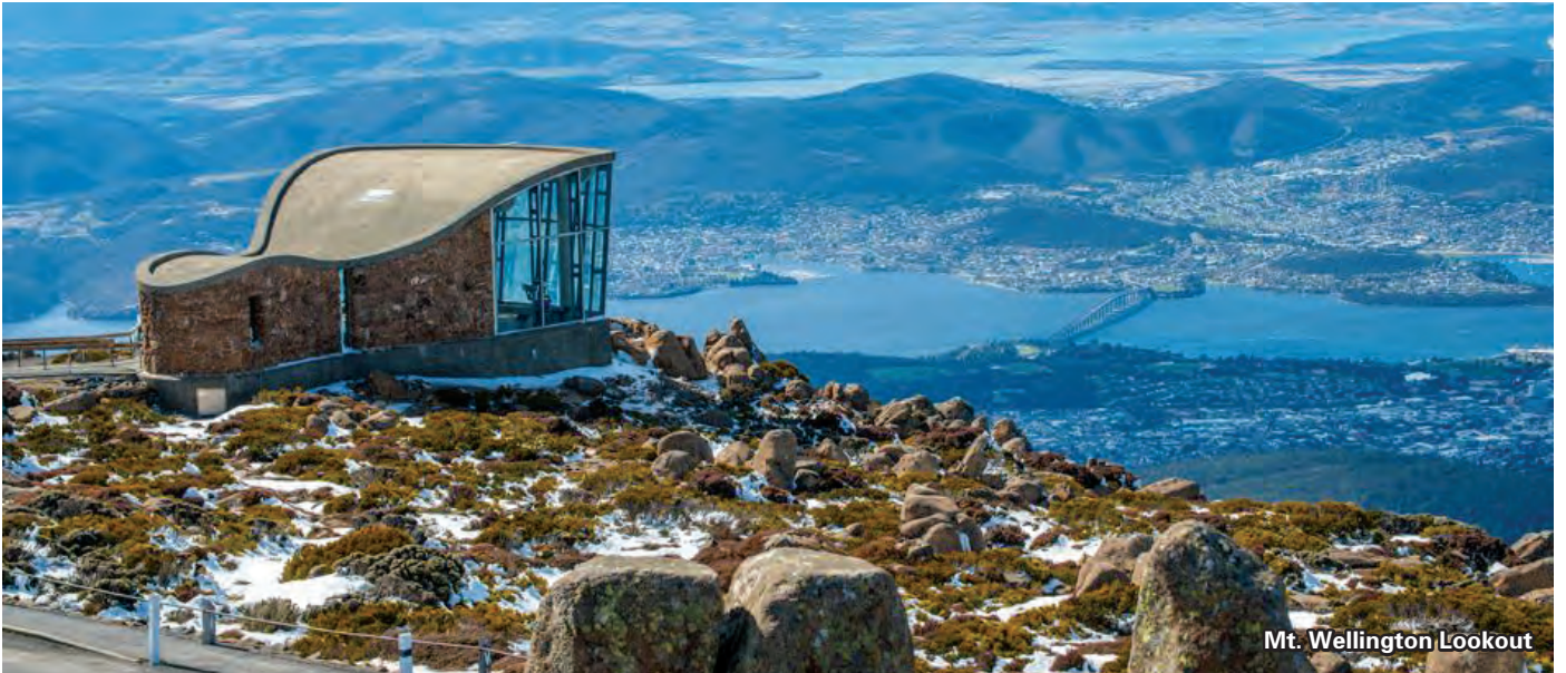
Mt. Wellington Lookout