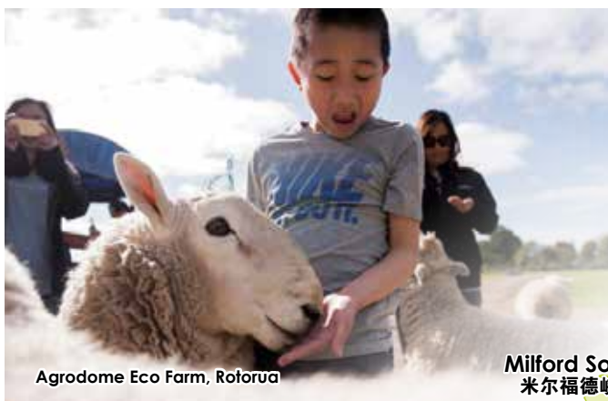
Agrodome Eco Farm, Rotorua