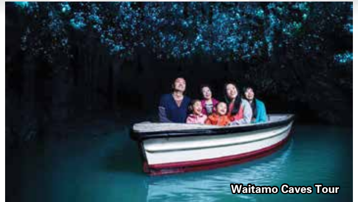
Waitomo Caves Tour