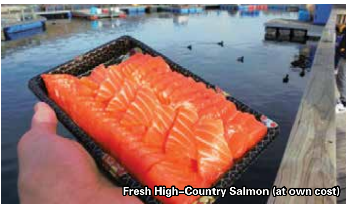
Fresh High-Country Salmon (at own cost)