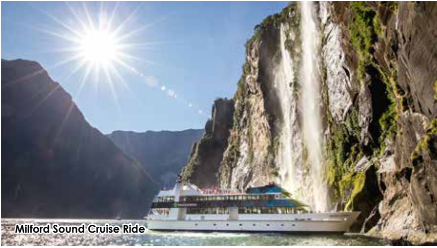
Milford Sound Cruise Ride