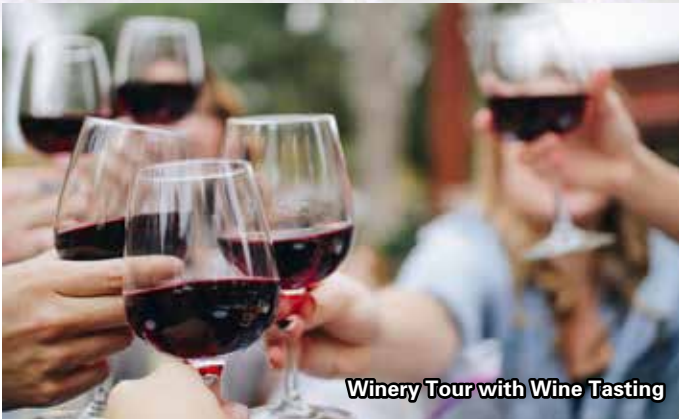
Winery Tour with Wine Tasting