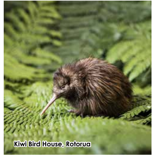
Kiwi Bird House, Rotorua