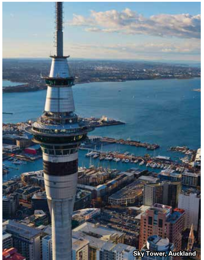
Sky Tower, Auckland