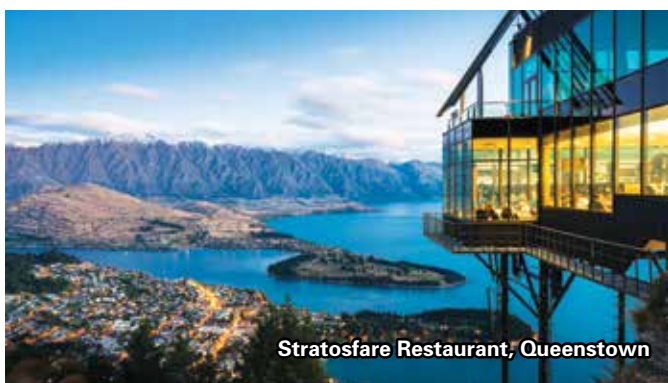
Stratosfare Restaurant, Queenstown

Visit this unique farmland, a fairy-tale place as featured in The Hobbit and The Lord of the Rings film trilogies. Immerse yourself in the sights, smells, sounds and tastes of the Shire.