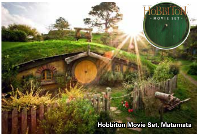
Hobbiton Movie Set, Matamata