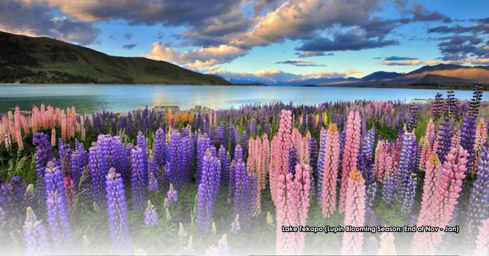
Lake Tekapo (Lupin Blooming Season: End of Nov - Jan)