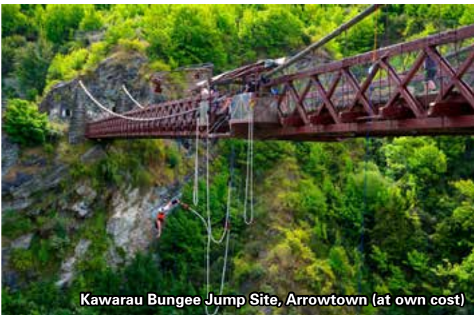
Kawarau Bungee Jump Site, Arrowtown (at own cost)