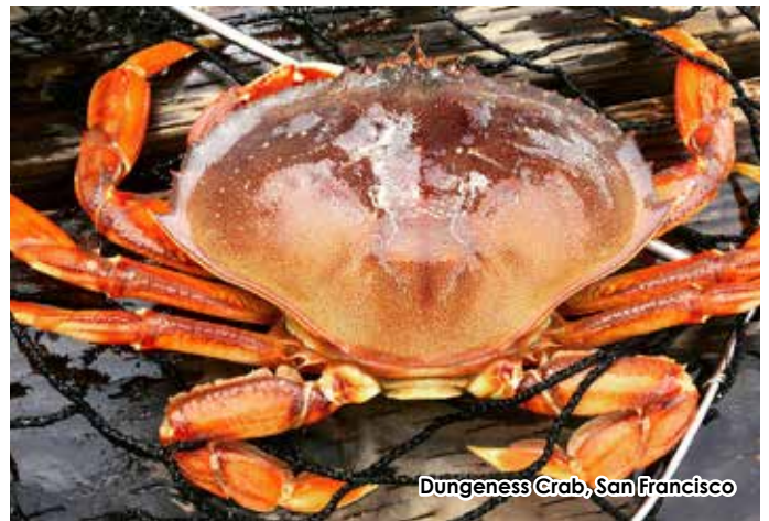
Dungeness Crab, San Francisco