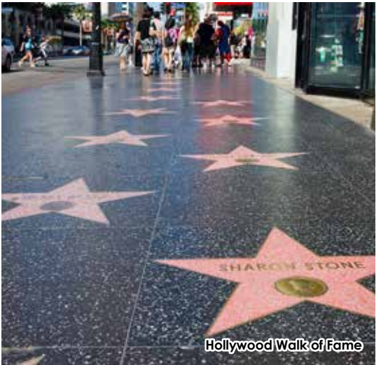
Hollywood Walk of Fame