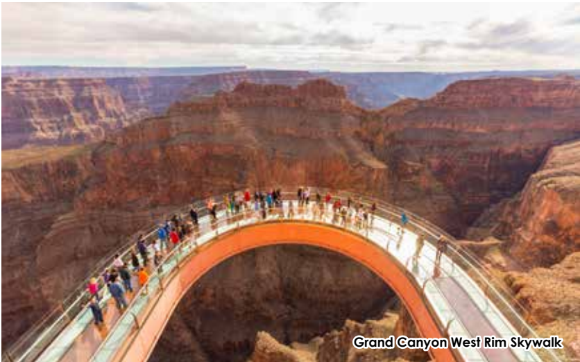
Grand Canyon West Rim Skywalk