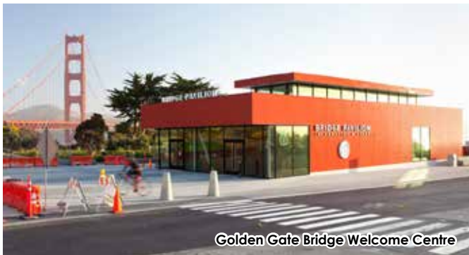
Golden Gate Bridge Welcome Centre