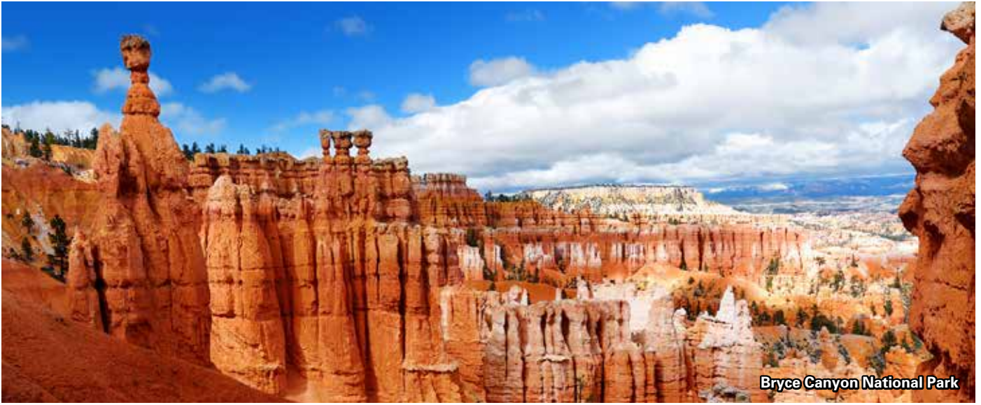
Bryce Canyon National Park