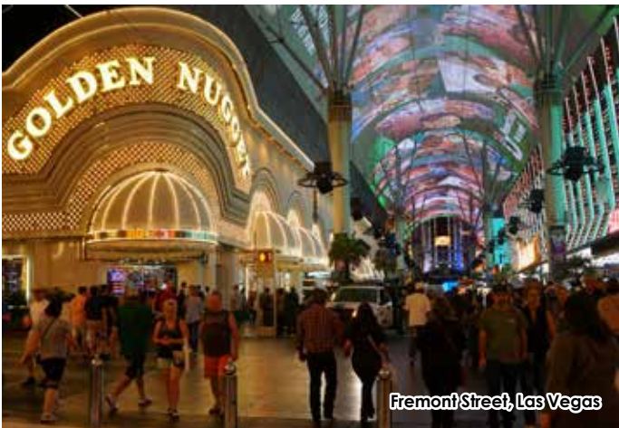
Fremont Street, Las Vegas