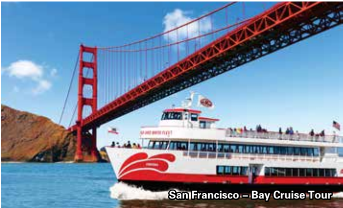
San Francisco - Bay Cruise Tour