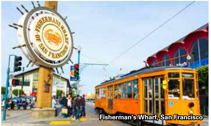
Fisherman's Wharf, San Francisco