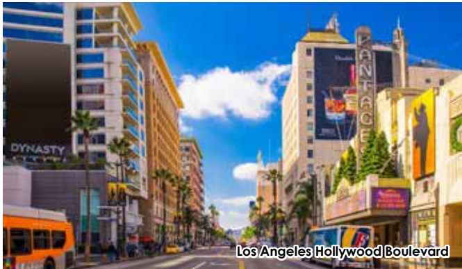
Los Angeles Hollywood Boulevard

Today, depart to Los Angeles with a stop at Barstow for lunch and some retail therapy at the Tanger Outlets.