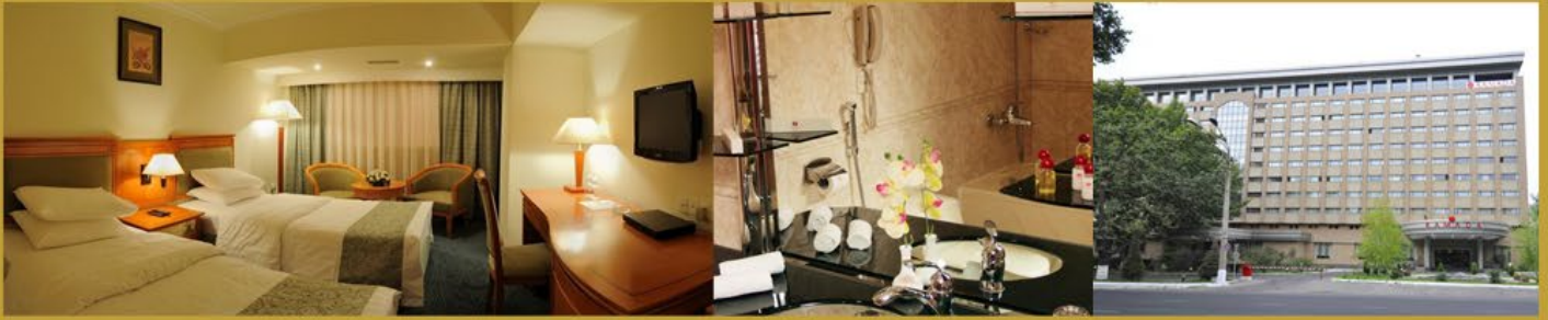
Tashkent Ramada Hotel 塔什干华美达酒店