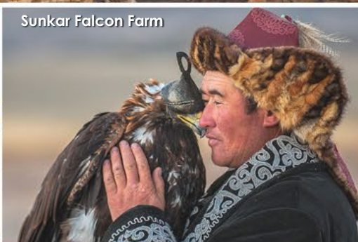
Sunkar Falcon Farm