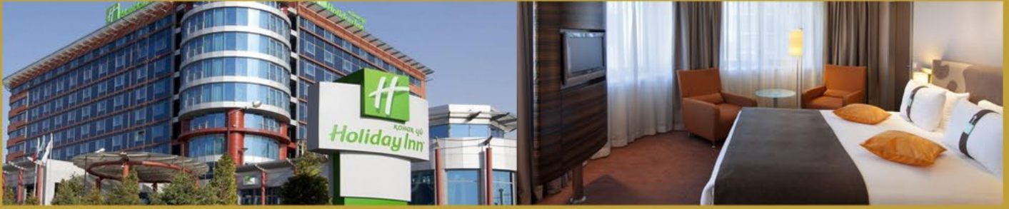
Almaty Holiday Inn Hotel 阿拉木图智选假日酒店