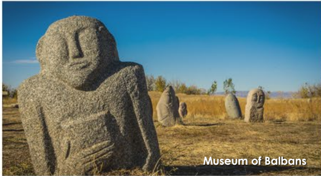
Museum of Balbans