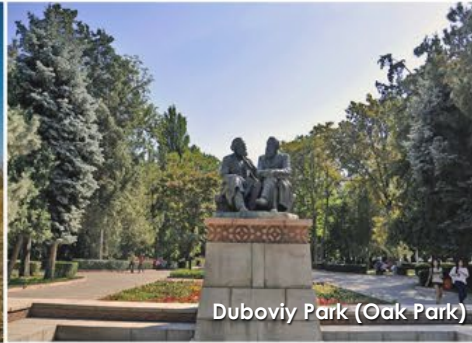
Duboviy Park (Oak Park)