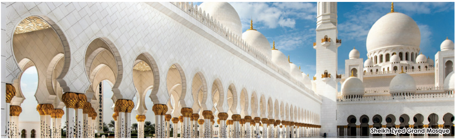
Sheikh Zayed Grand Mosque