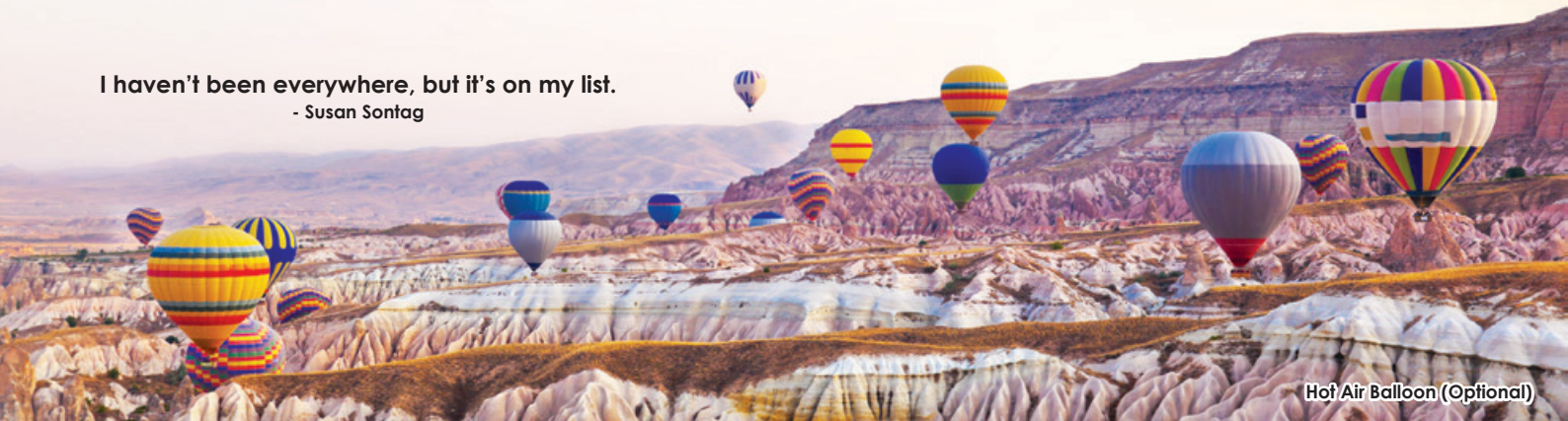
Hot Air Balloon (Optional)