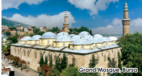
Grand Mosque, Bursa