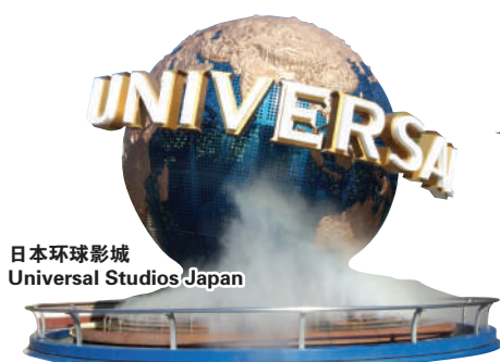
日本环球影城 Universal Studios Japan

Besides international brand, you can find local Japanese brand as well. From time to time, there will be added value promotions!