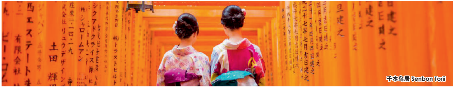
千本鸟居 Senbon Torii