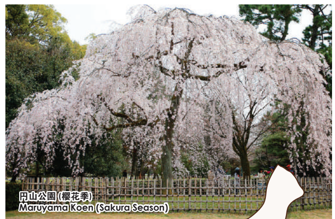
田山公園 (櫻花季) Maruyama Koen (Sakura Season)