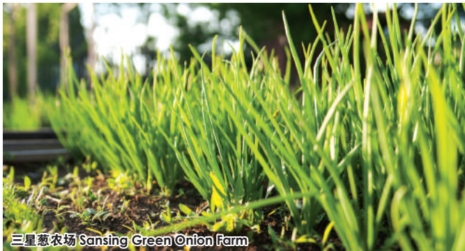
三星葱农场 Sansing Green Onion Farm

Come here to let you experience the most interesting farming life.