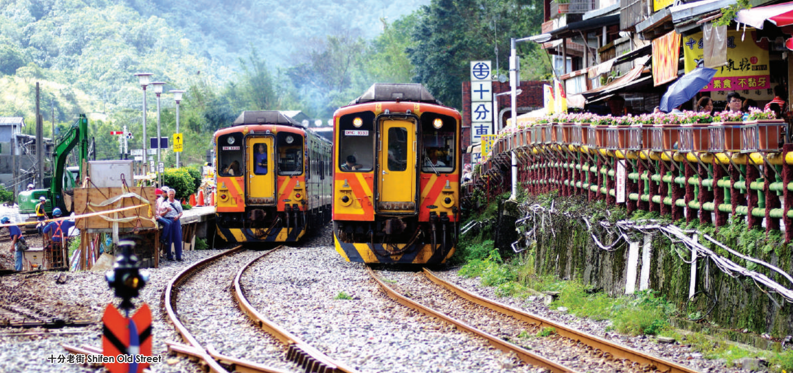
十分老街 Shifen Old Street