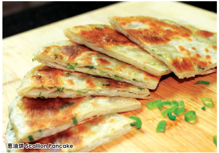
葱油饼 Scallion Pancake

Extraordinary - Reminiscence Cuisine Celebrated Roast Duck - Cherry Duck Cuisine Taiwan Must Eat - Steamboat Buffet