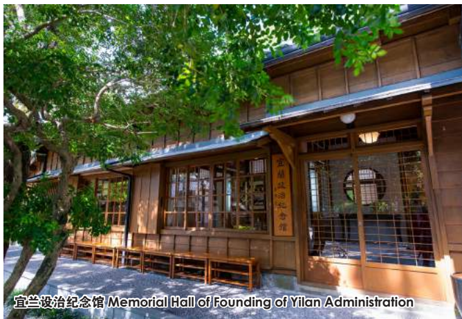
宜兰设治纪念馆 Memorial Hall of Founding of Yilan Administration

在2001年6月依据文化遗产保存法公告为历史建筑，以日本木造房舍与西洋建筑的形式，呈现出强烈的“和洋式风格”，是宜兰旅游和拍照热点。