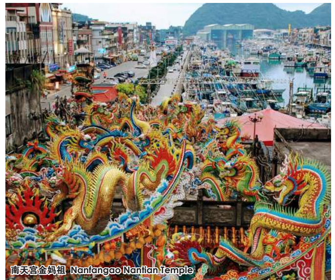
南天宮金媽祖 Nanfanggao Nantian Temple

Transfer to airport for the flight back home.