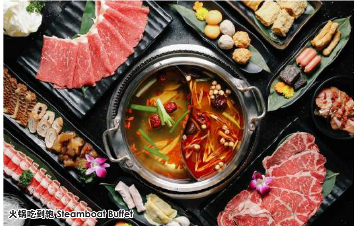
火锅吃到饱 Steamboat Buffet