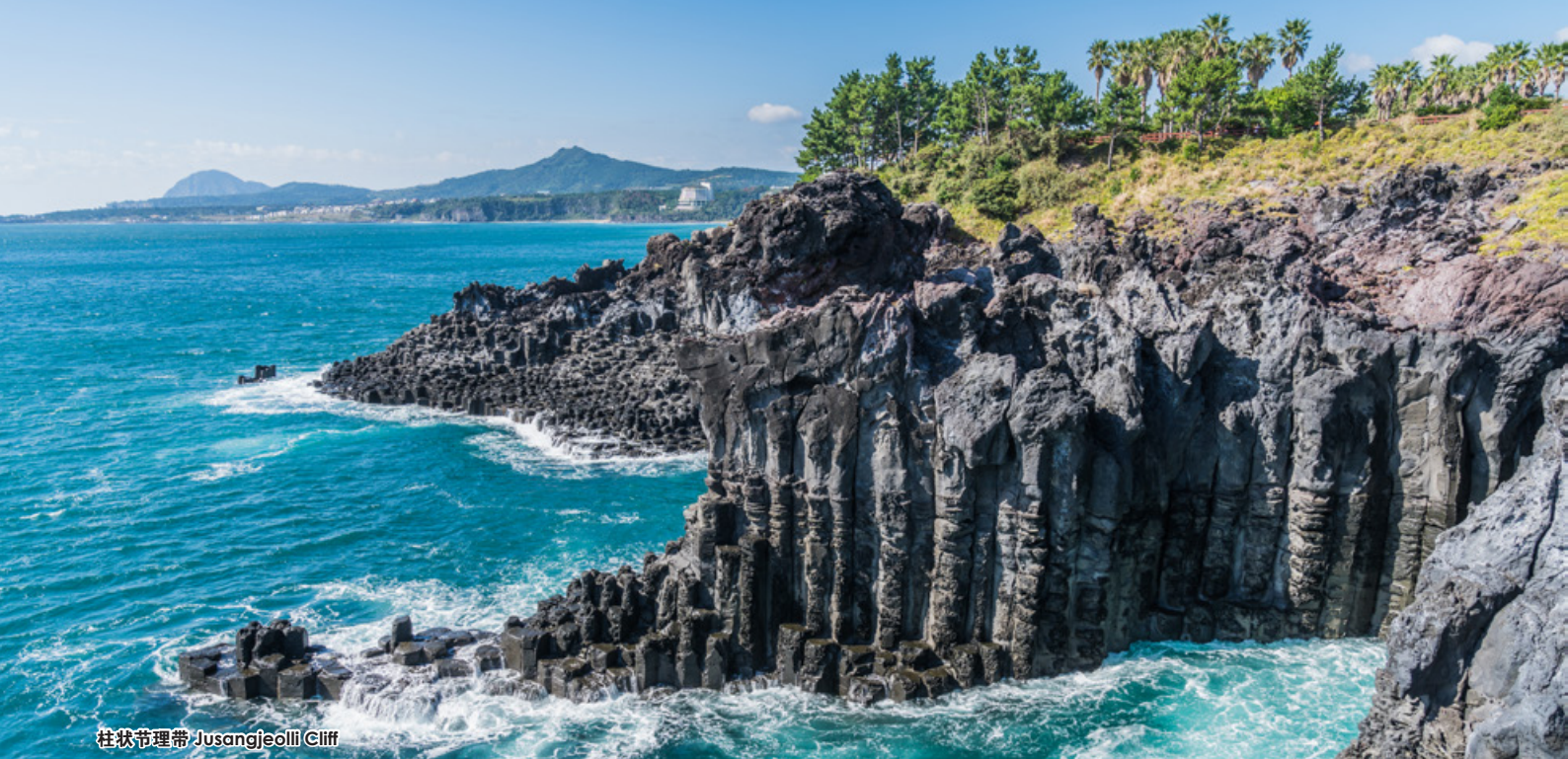
柱状节理带 Jusanjeollil Cliff