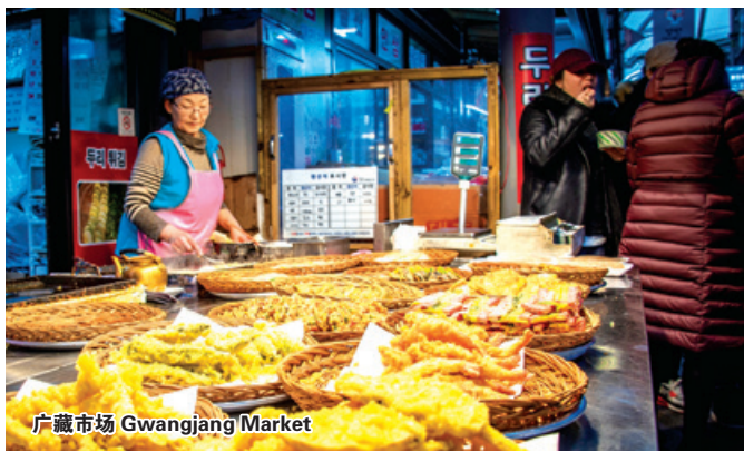
广藏市场 Gwangjang Market

自16世纪以来，这座神殿以其目前的形式存在着，是儒家皇家神殿中最古老、最真实的，也是联合国教科文组织世界遗产。