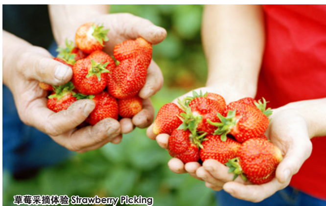
草莓采摘体验 Strawberry Picking

※The festival is subject to weather condition and our company reserves the right to amend the itinerary due to unforeseen circumstances.