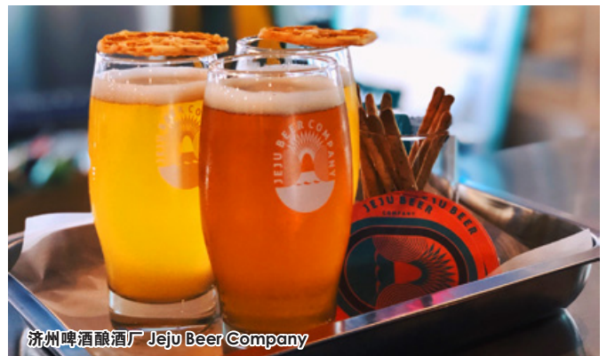
济州啤酒酿酒厂 Jeju Beer Company

Proceed to airport for your flight back home with unforgettable memories.