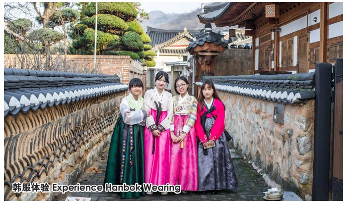
韩服体验 Experience Hanbok Wearing

Assorted Seafood With Chicken Steamboat | Black Pork Bulgogi + Hallasan Fried Rice | Sashimi Set | Seafood Buffet | Jeonju Bibimbap