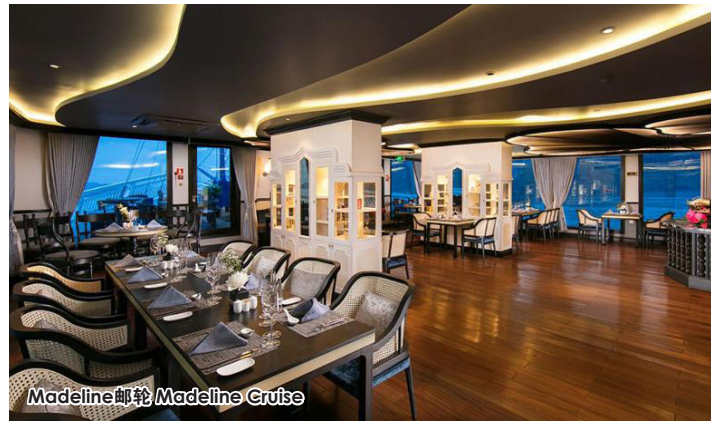
Madeline邮轮 Madeline Cruise