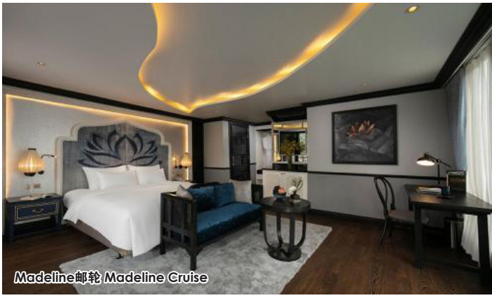
Madeline邮轮 Madeline Cruise