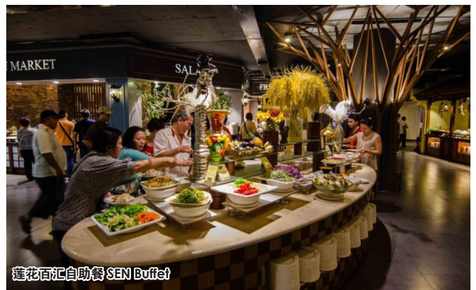
莲花百记自助餐 SEN Buffet