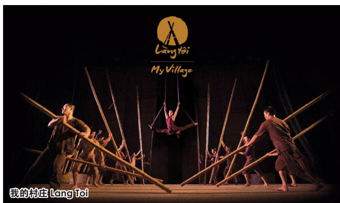
我的村庄 Lang Toi

表演汇聚了顶尖的杂技，优雅的舞蹈以及由经验丰富的音乐家和艺术家现场演奏20种不同的民间音乐。