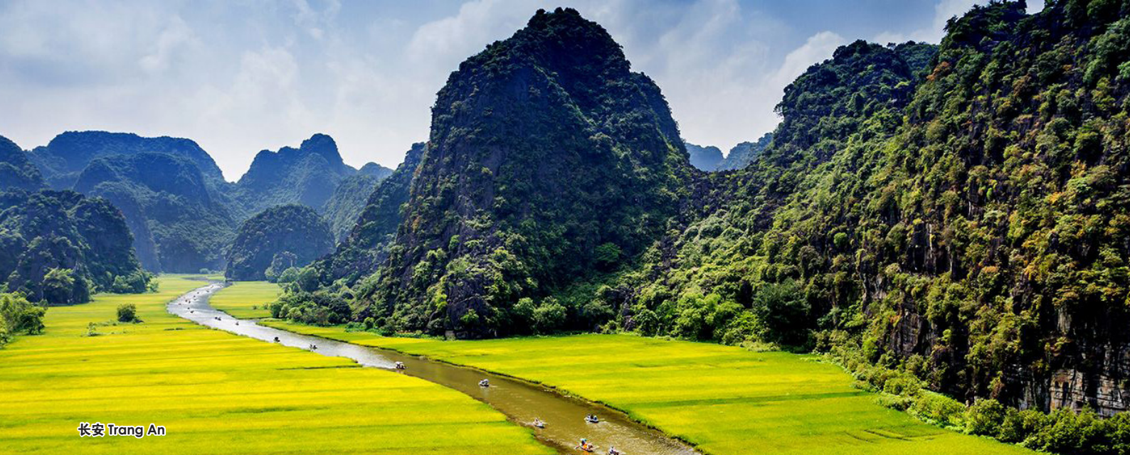
长安 Trang An