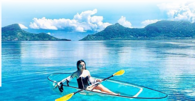
Romantic Glass Boat Experience