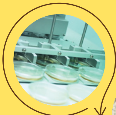
Preparing Culture Media