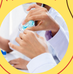
Standardised On \beta -1, 3-1, 6 Glucan