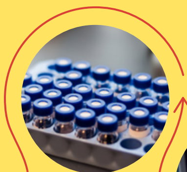
Chemical Profiling Test (HPLC-MSMS)