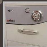
Key Lock & Combination