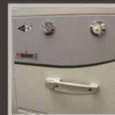
Dual Key Lock