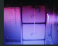
Actual Burning of Test Object