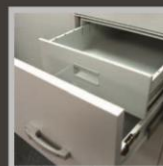
Twin Deck Drawer