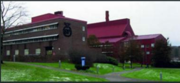
SP Technical Research Institute of Sweden