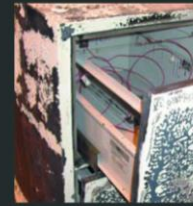
After Test (180mins), plastic sticker still intact